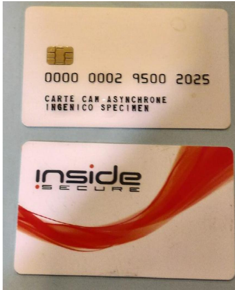
Bank & RFID card