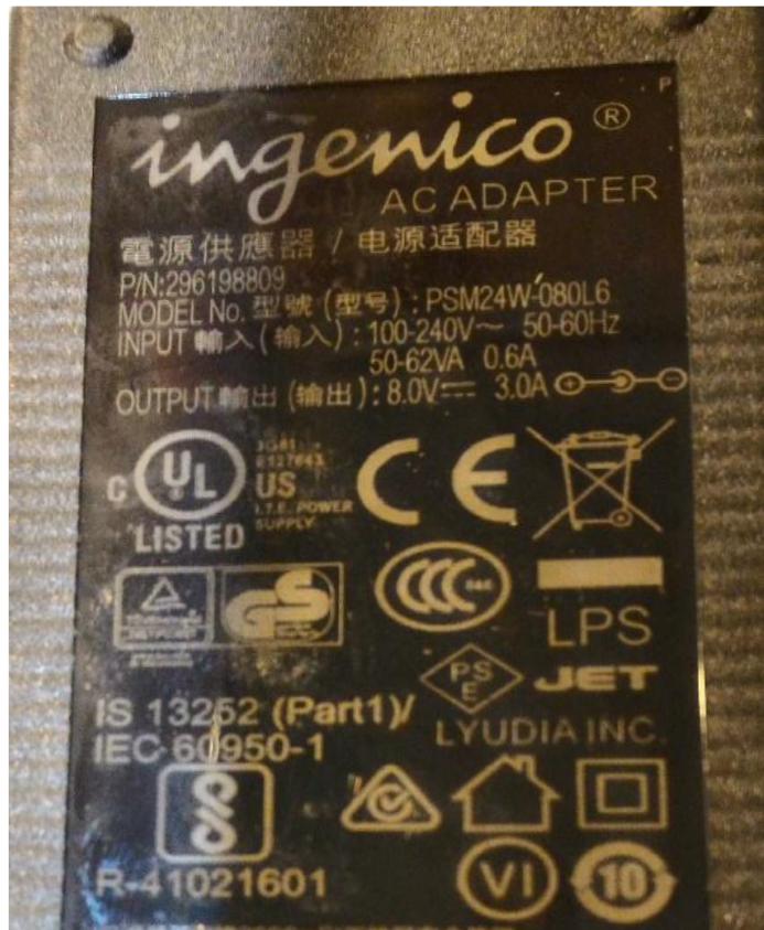
Power supply labeling