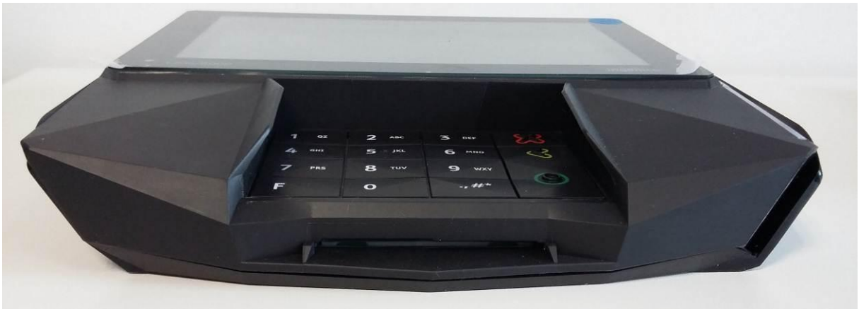
Bottom side view