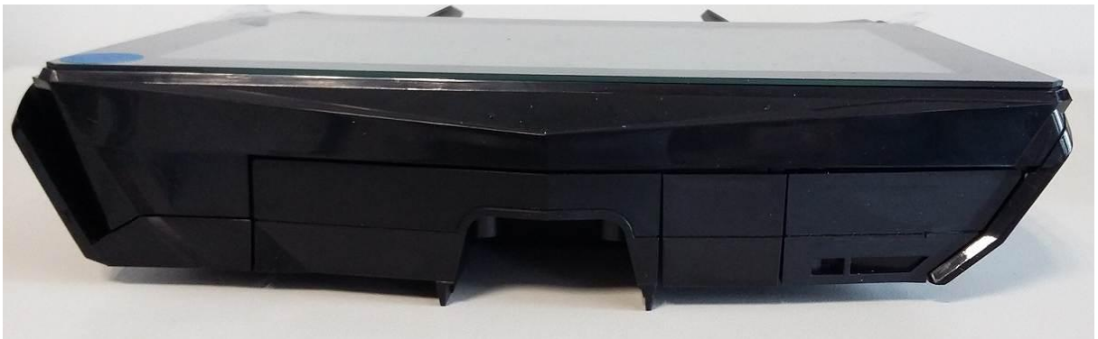
Top side view