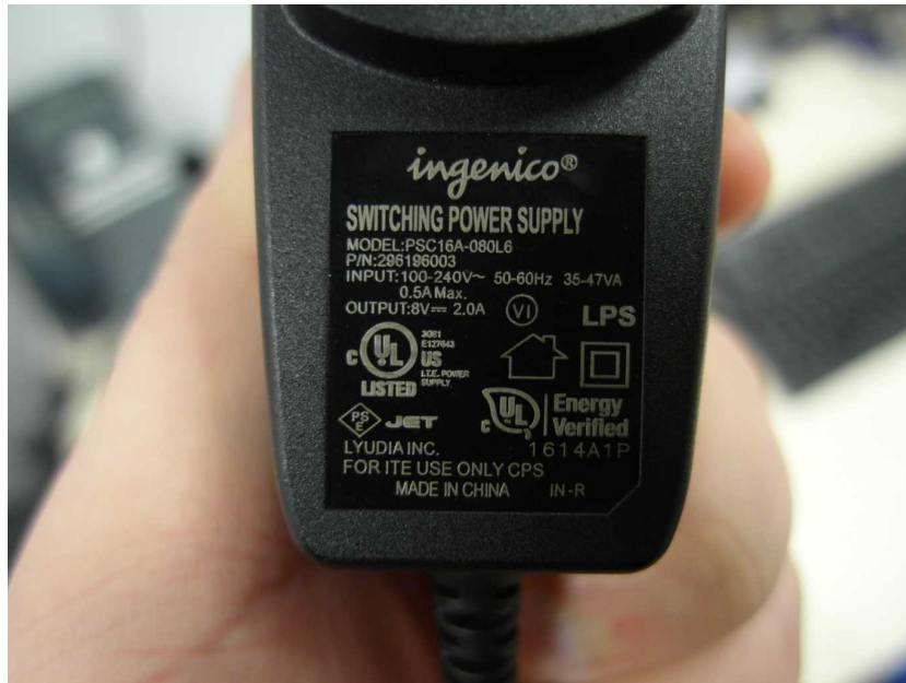
power supply label view