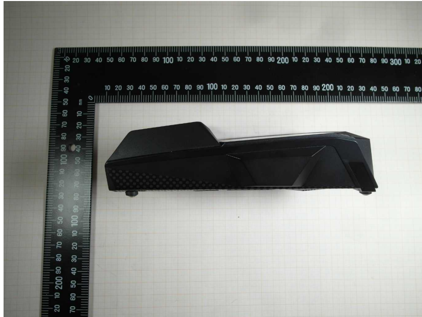
DUT side face