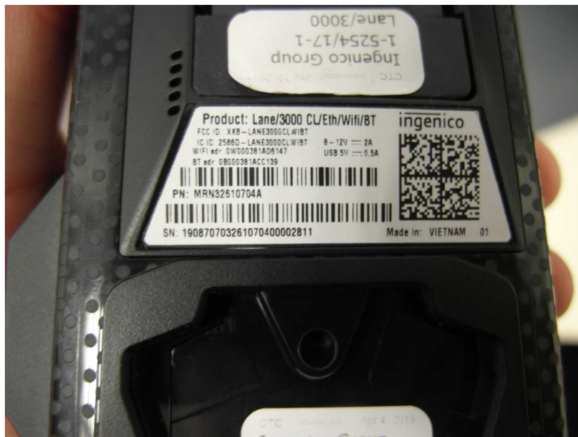
DUT label view