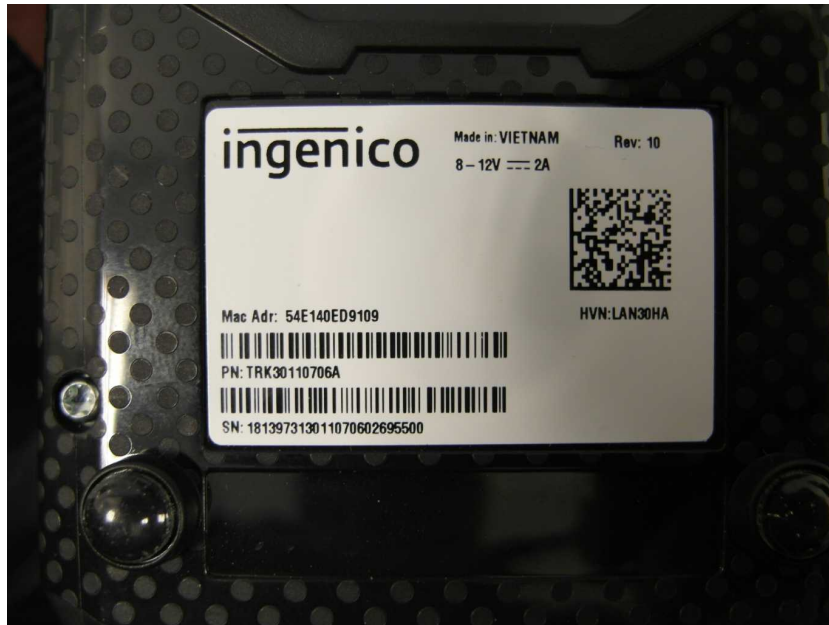
DUT label view