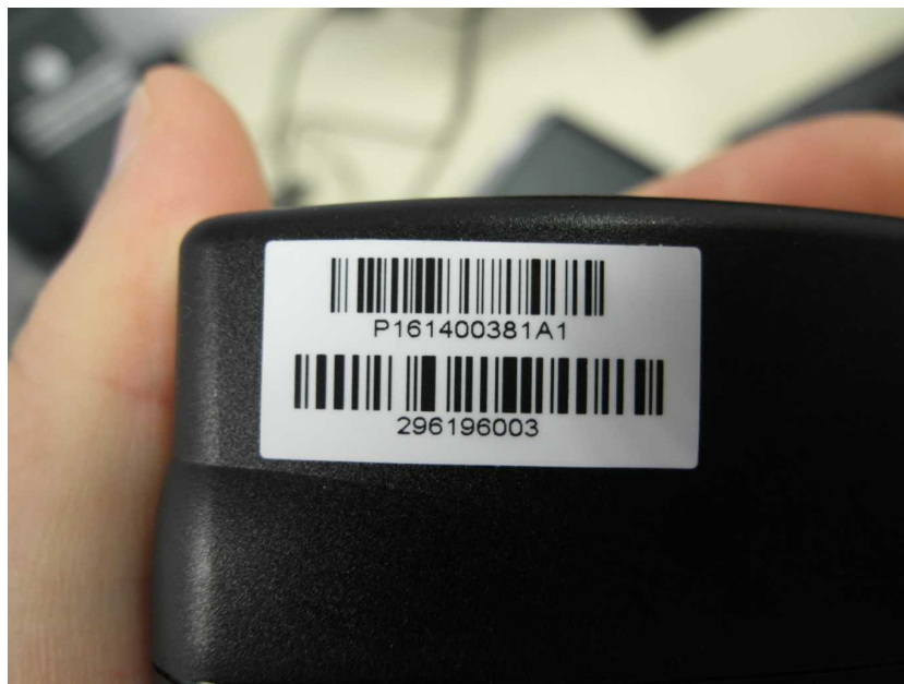
power supply labelview