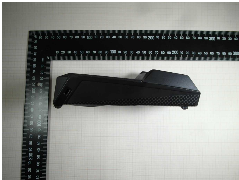
DUT side face