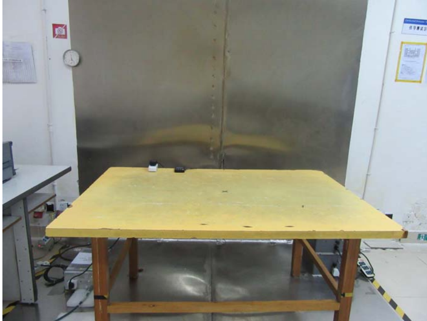
Conducted Emissions – Side View