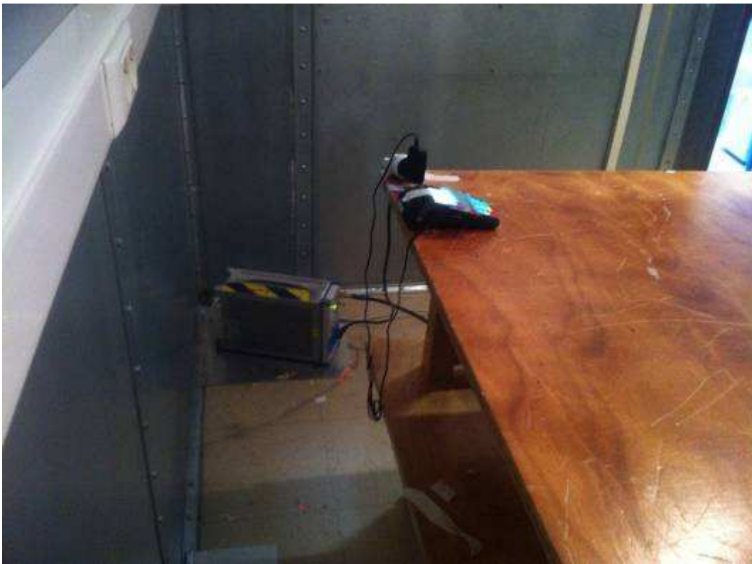
Typical Configuration (Power supply through \mu USB port)