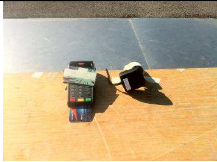
Typical Configuration (Power supply trough \mu USB port)