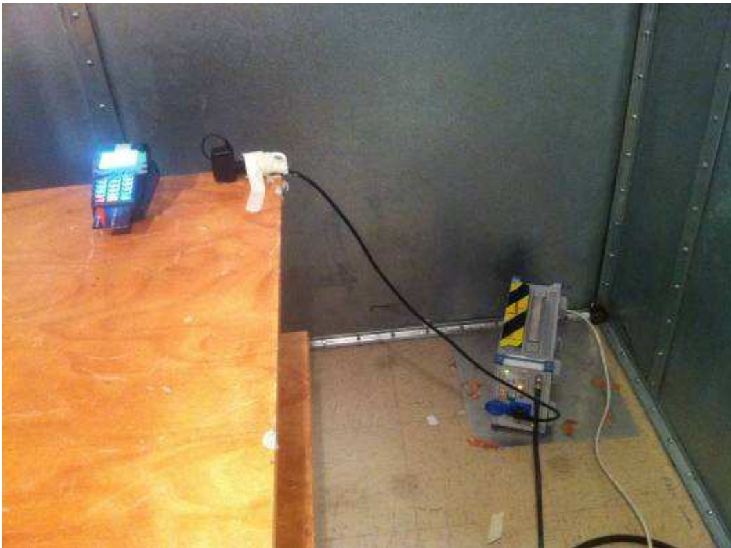
Typical Configuration (Base + power supply "Jack version")