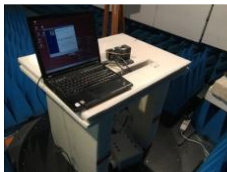
Test setup in anechoic chamber (Configuration2 and axis Z)