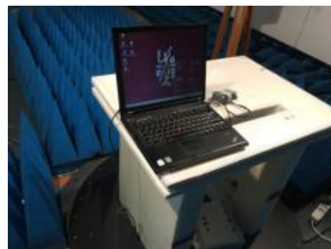
Test setup in anechoic chamber (Configuration1 and axis Z)