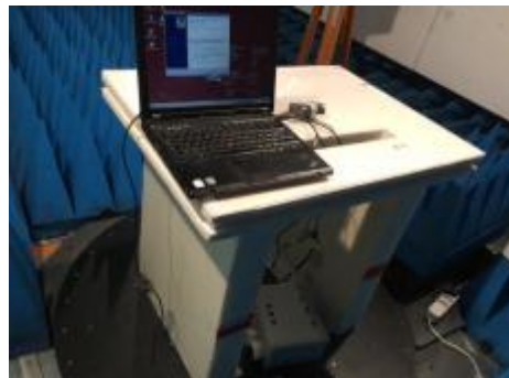
Test setup in anechoic chamber (Configuration2 and axis XZ)