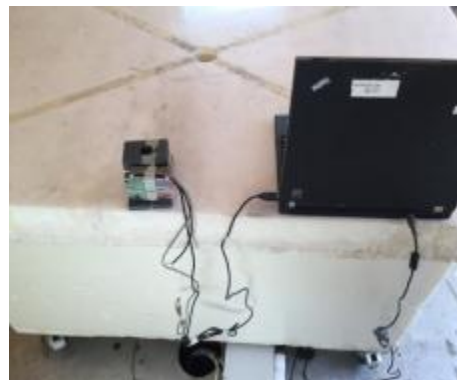
Test setup on OATS