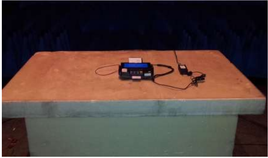
Radiated emissions measurements