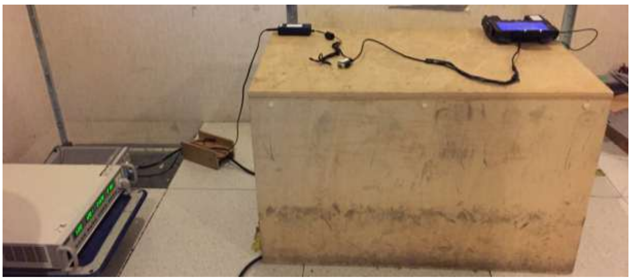
Conducted emission measurements