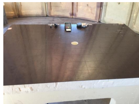
General Test setup on OATS