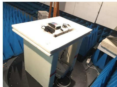
General Test setup in anechoic chamber