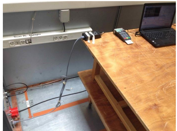
Test setup Configuration 4: