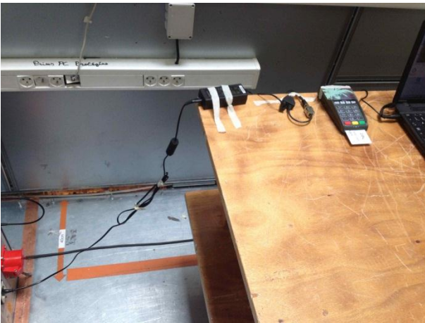
Test setup Configuration 3: