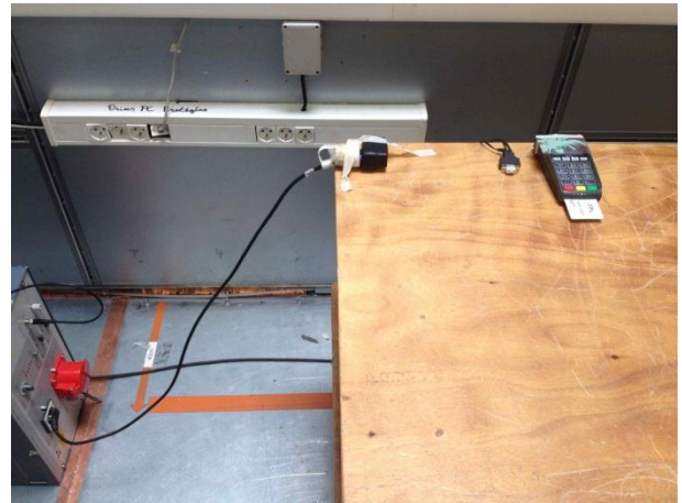
Test setup Configuration 2: