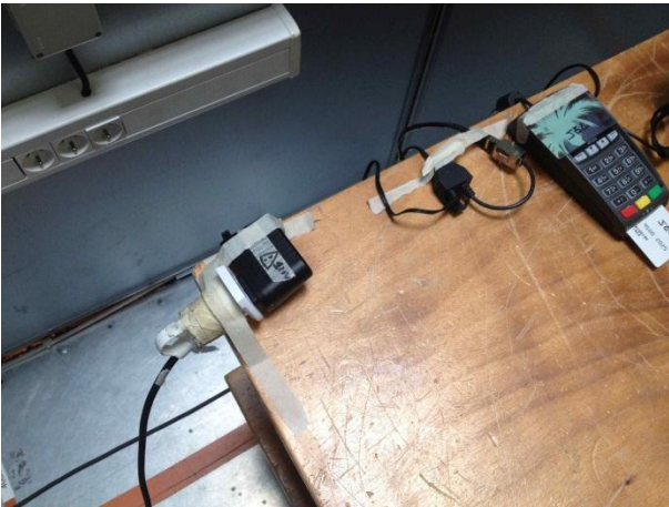
Test setup Configuration 1: