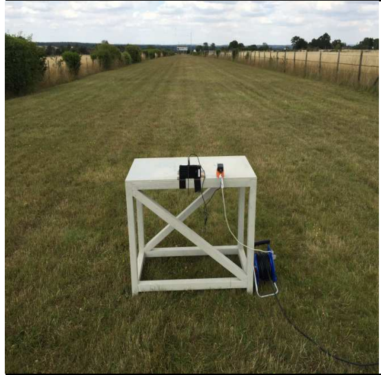
Set up for 300 metre measurements