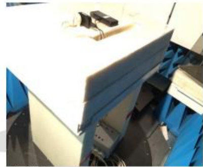
Test setup in anechoic chamber (configuration 1, axis XY)