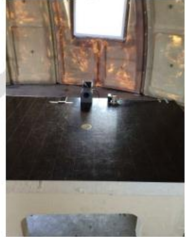
Test setup on OATS (configuration 1 and worst case see in pre-characterization):