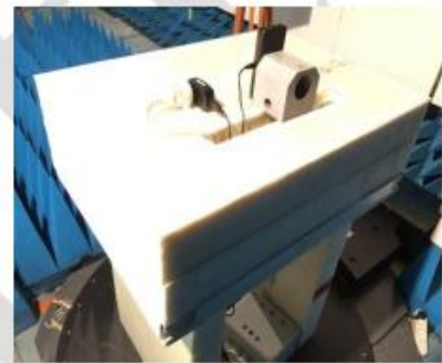
Test setup in anechoic chamber (configuration 1, axis Z)