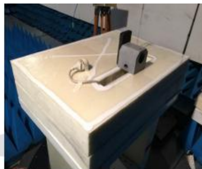
Test setup in anechoic chamber (configuration 2. axis Z)