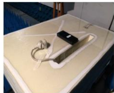
Test setup in anechoic chamber (configuration 2, axis XY)