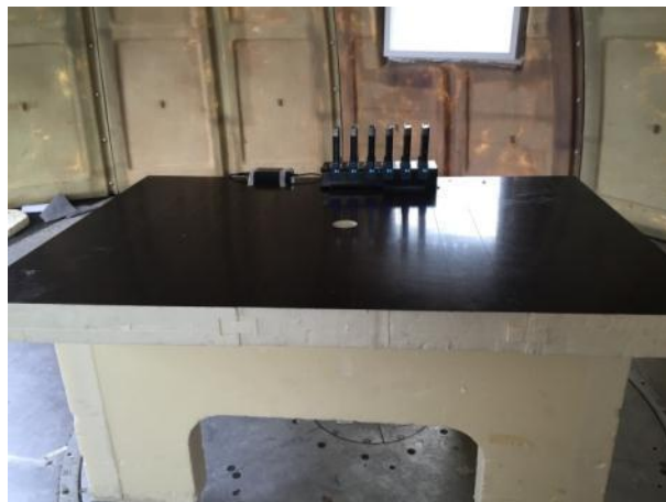
Test setup on OATS