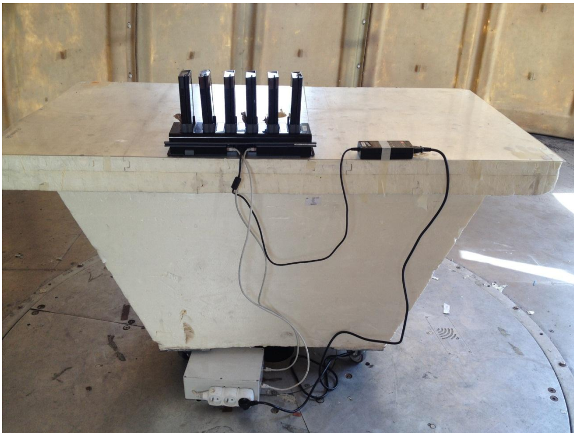
Test setup on OATS