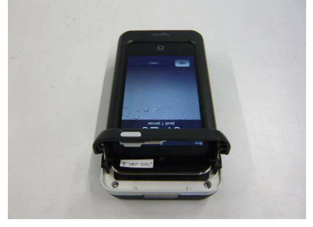
General views for plugged or unplugged IPOD