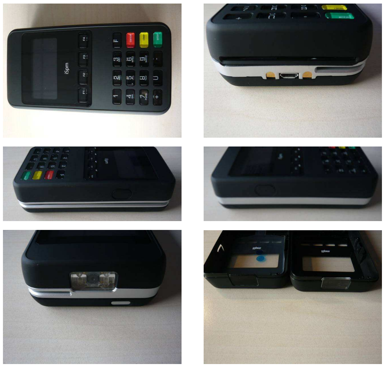
General views (Difference between version with or without barcode reader)