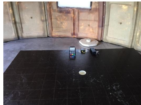
Test setup on OATS