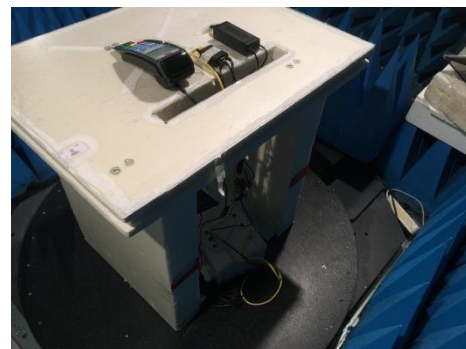
Test setup in anechoic chamber