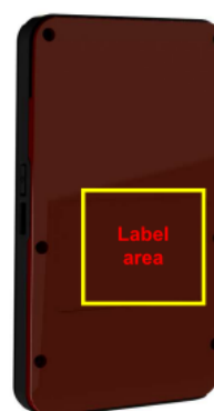
Figure n°2: Bottom side of the product