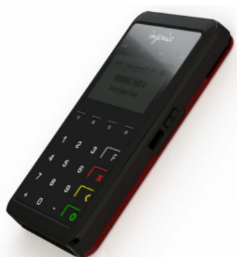
Figure n°1: Top side of the product