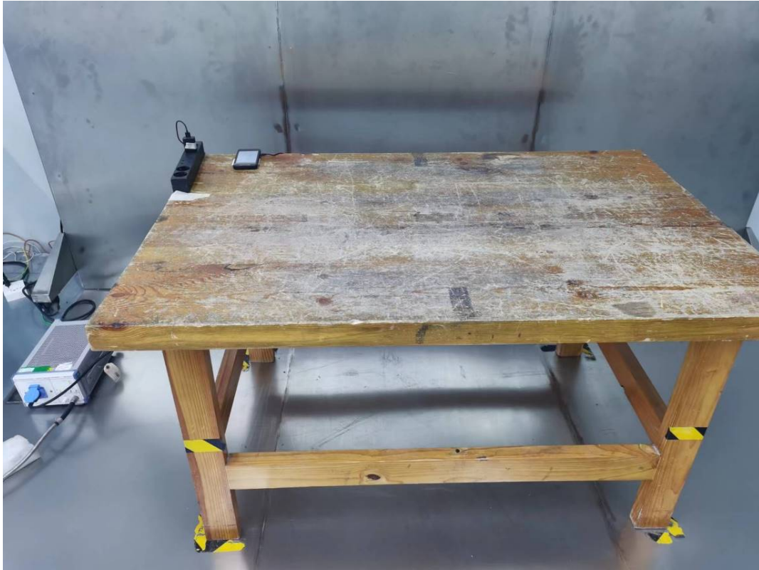
Conducted Emissions Side View-Worst Adapter 5#+Configuration 1#