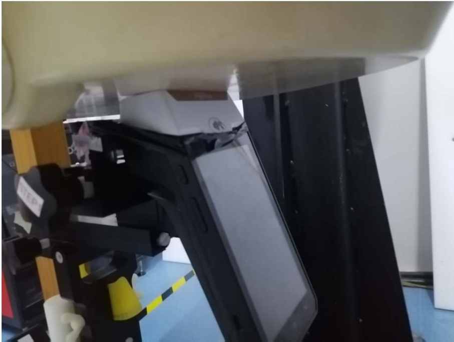
Handheld Top2 Setup Photo (0mm)