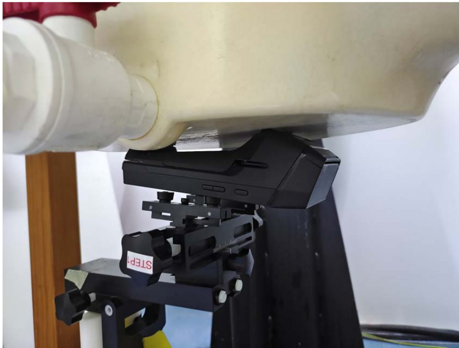
Handheld Front Setup Photo (0mm)