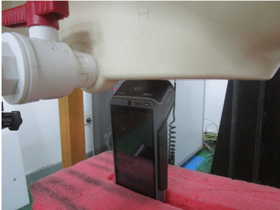
Handheld Bottom Setup Photo(0mm)