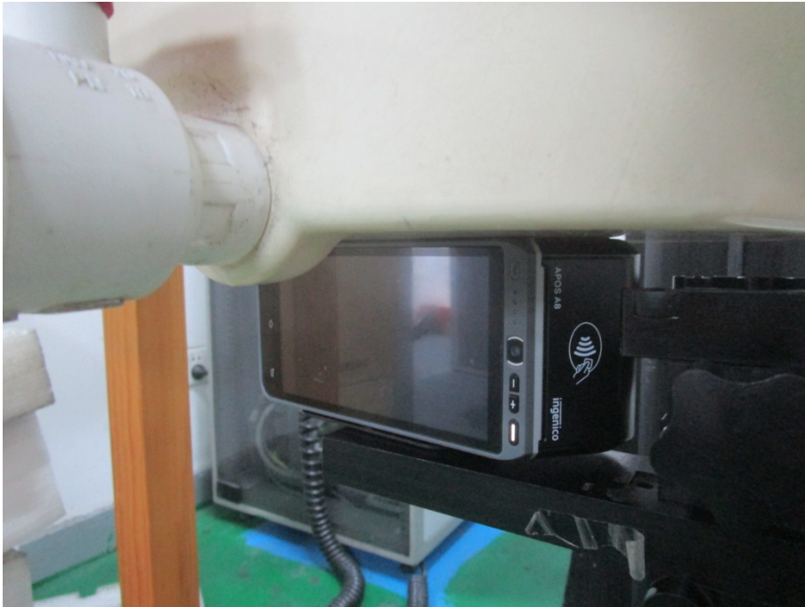
Handheld Right Setup Photo(0mm)