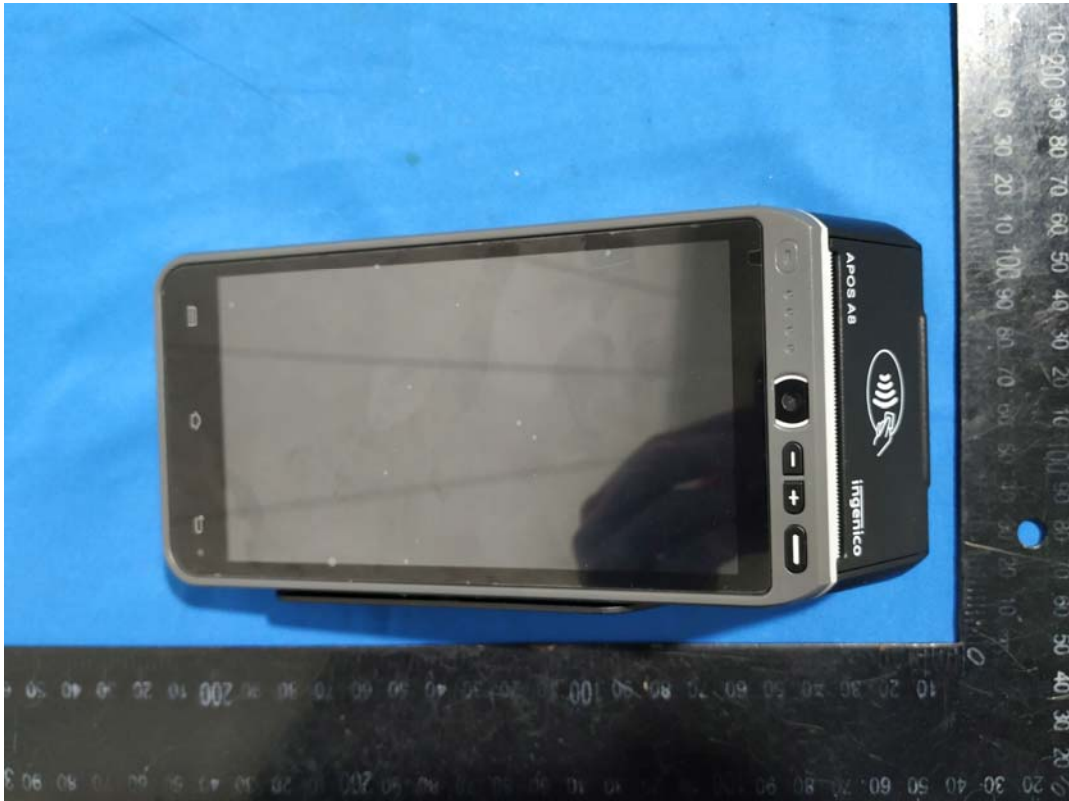
EUT Configuration 1(LCD:SKYWORTH)