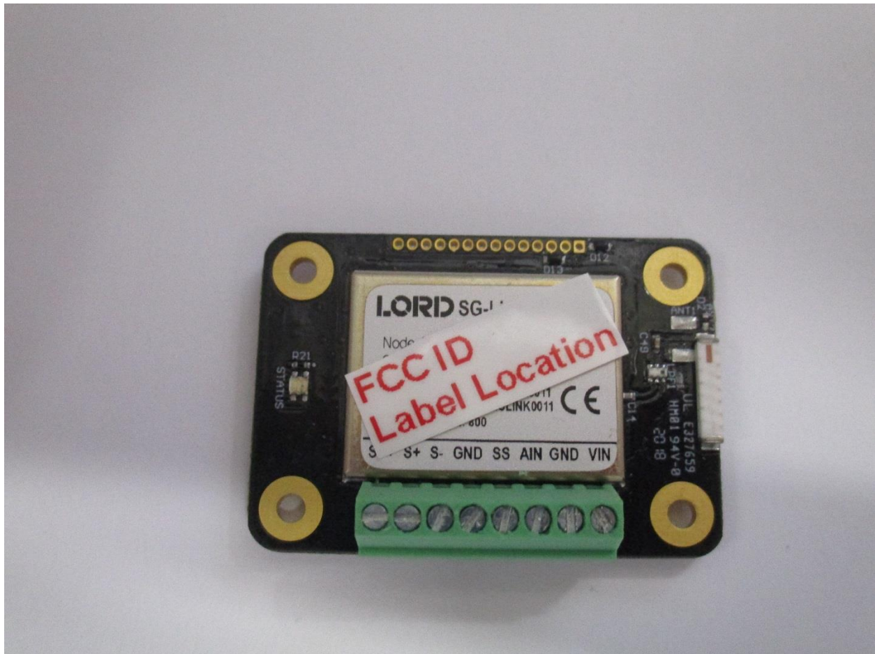
Module PCB with Internal Antenna, Top