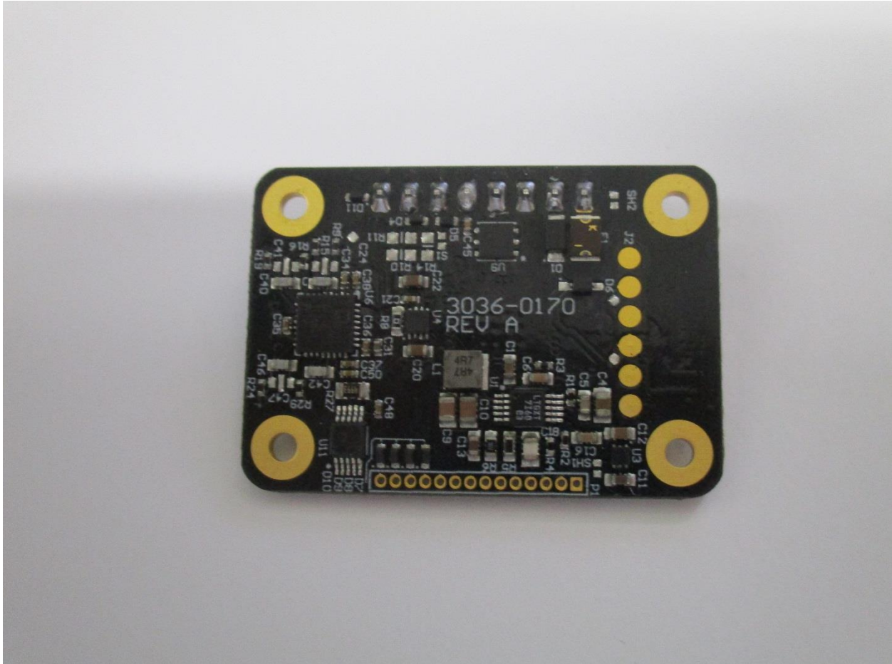
Module PCB Bottom