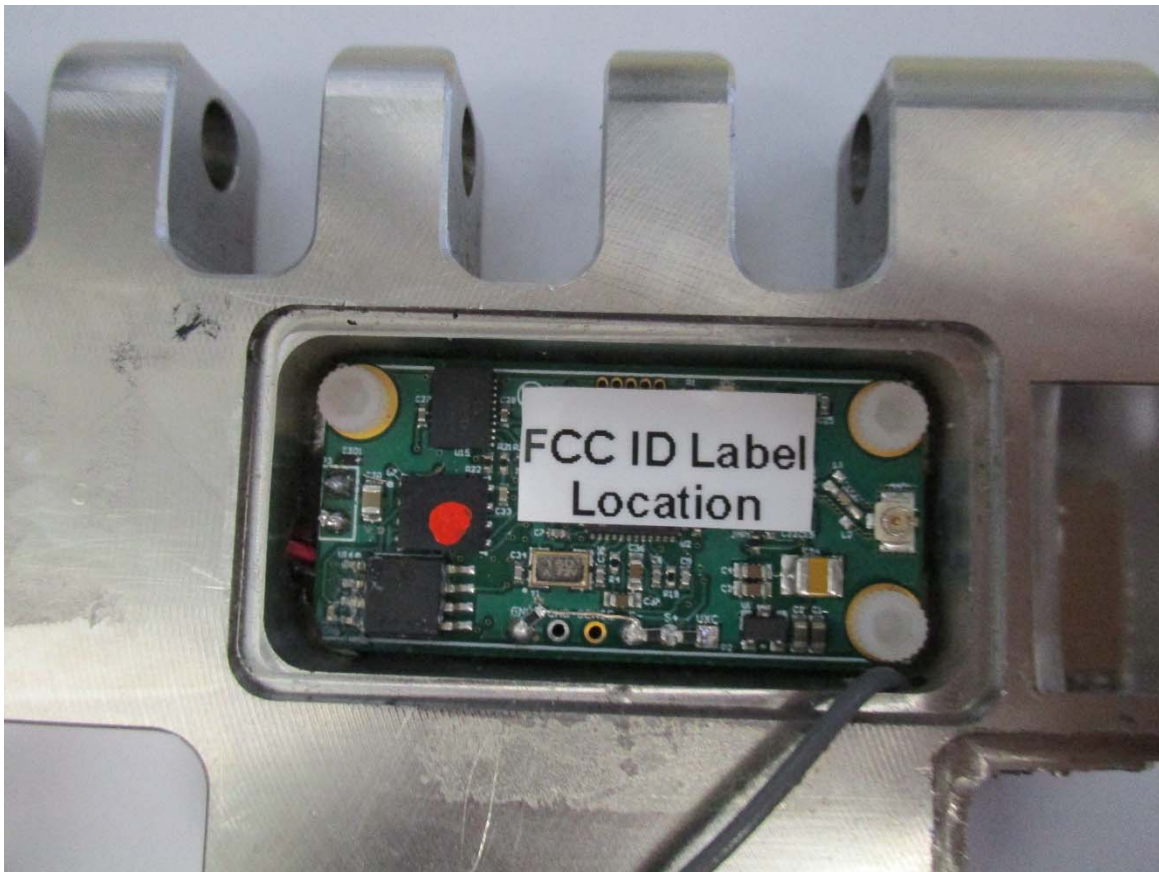
PCB In Host Enclosure