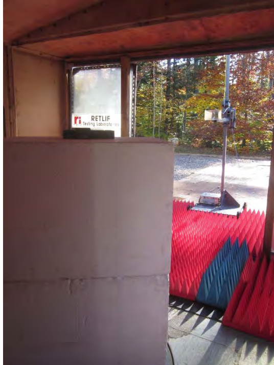
Vertical Antenna Polarization, 1 GHz to 18 GHz