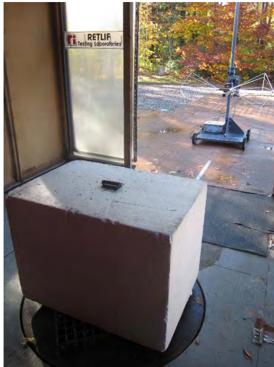
Horizontal Antenna Polarization, 30 MHz to 200 MHz, Biconical Antenna