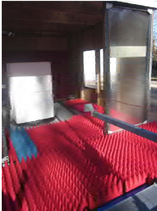
Vertical Antenna Polarization, 18 GHz to 25 GHz