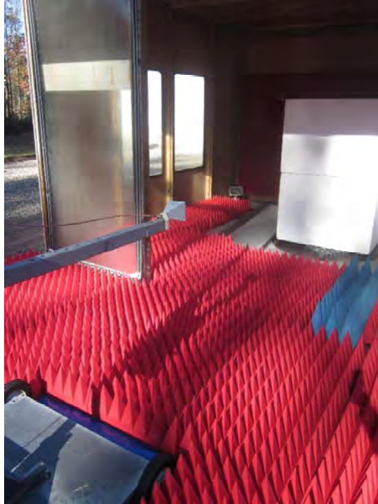
Horizontal Antenna Polarization, 18 GHz to 25 GHz