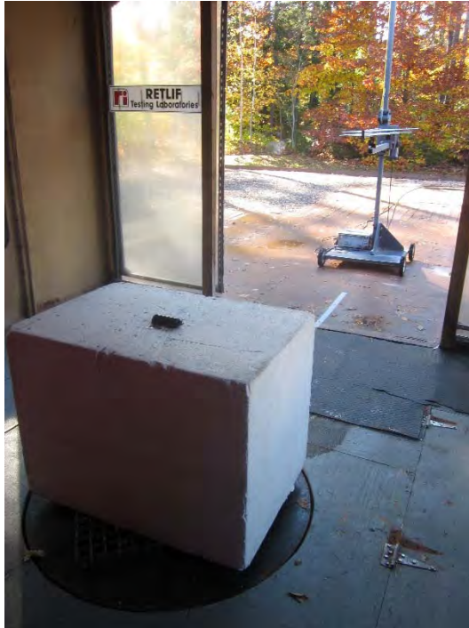
Horizontal Antenna Polarization, 200 MHz to 1 GHz, Log Periodic