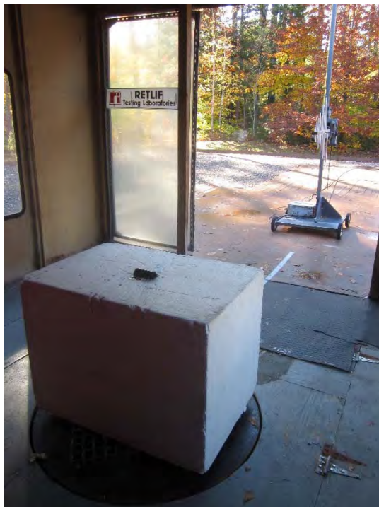
Vertical Antenna Polarization, 200 MHz to 1 GHz, Log Periodic