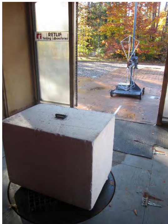
Vertical Antenna Polarization, 30 MHz to 200 MHz, Biconical Antenna