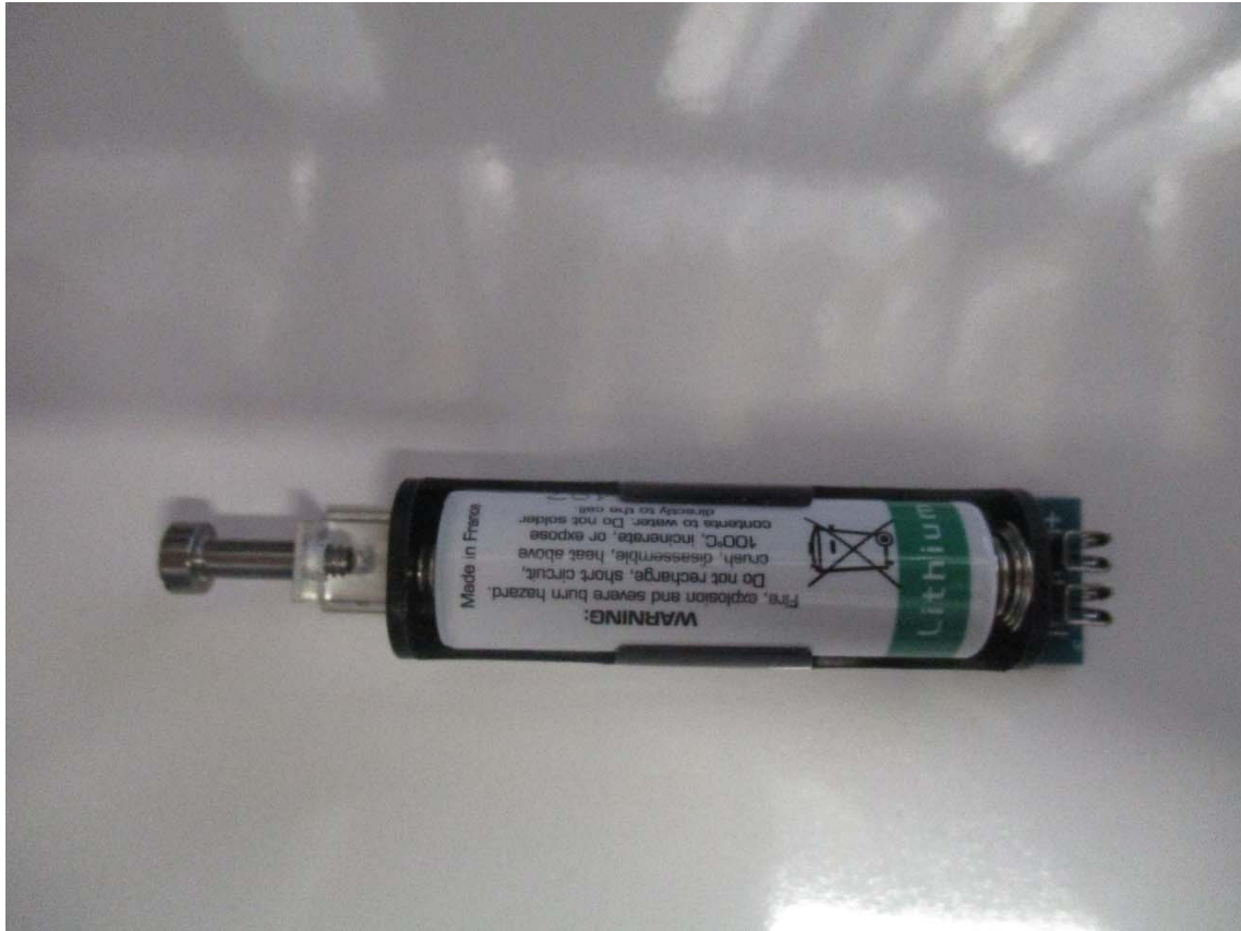
Internal Battery PCB Top