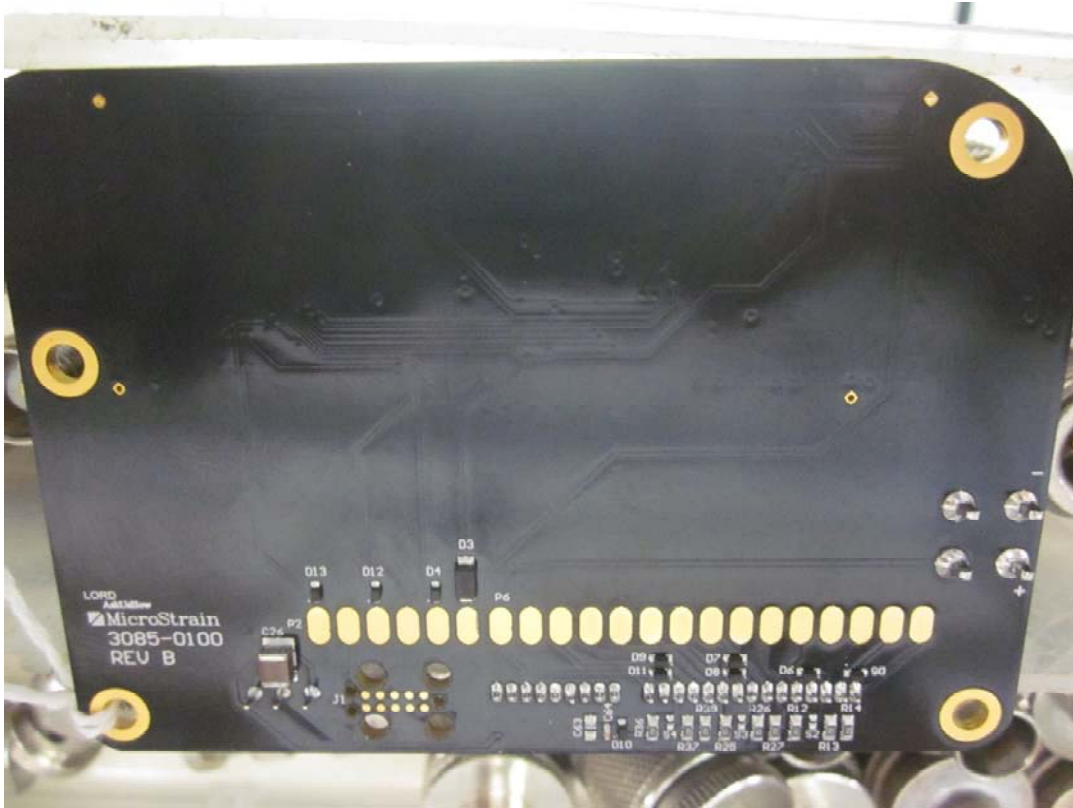
Internal Main PCB Bottom