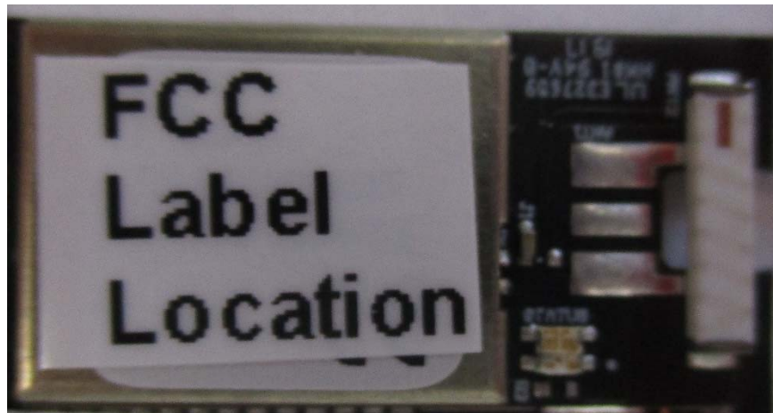
Module PCB with Internal Antenna, Top