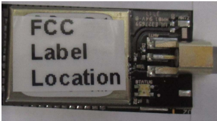
Module PCB with External Antenna Port, Top