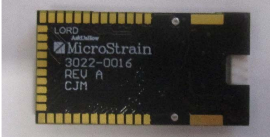
Module PCB Bottom