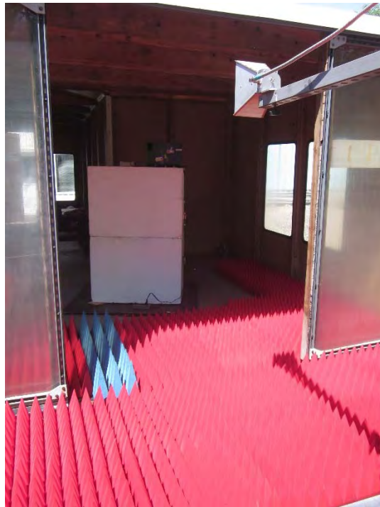
Horizontal Antenna Polarization, 1 GHz to 18 GHz