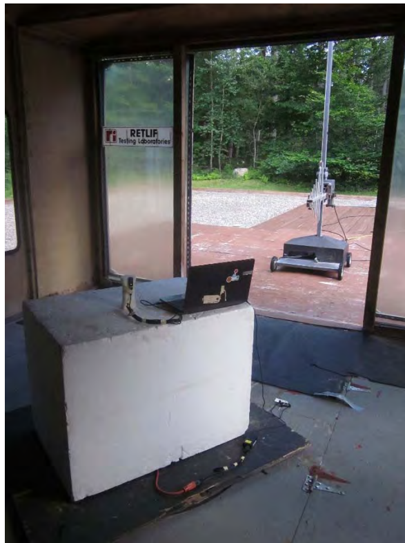
Vertical Antenna Polarization, 200 MHz to 1 GHz, Log Periodic