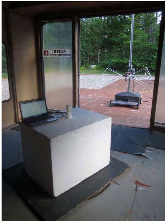
Horizontal Antenna Polarization, 30 MHz to 200 MHz, Biconical Antenna