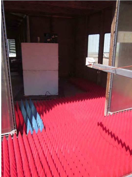
Horizontal Antenna Polarization, 18 GHz to 24 GHz