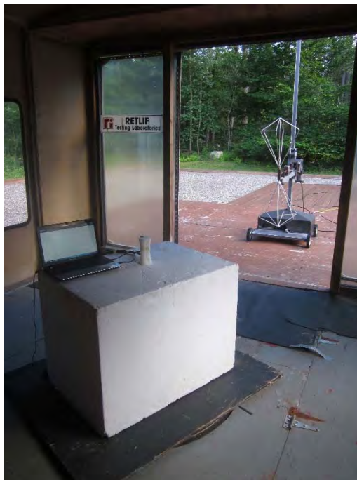
Vertical Antenna Polarization, 30 MHz to 200 MHz, Biconical Antenna