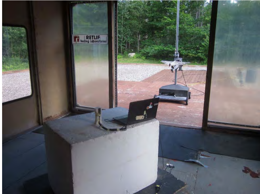
Horizontal Antenna Polarization, 200 MHz to 1 GHz, Log Periodic