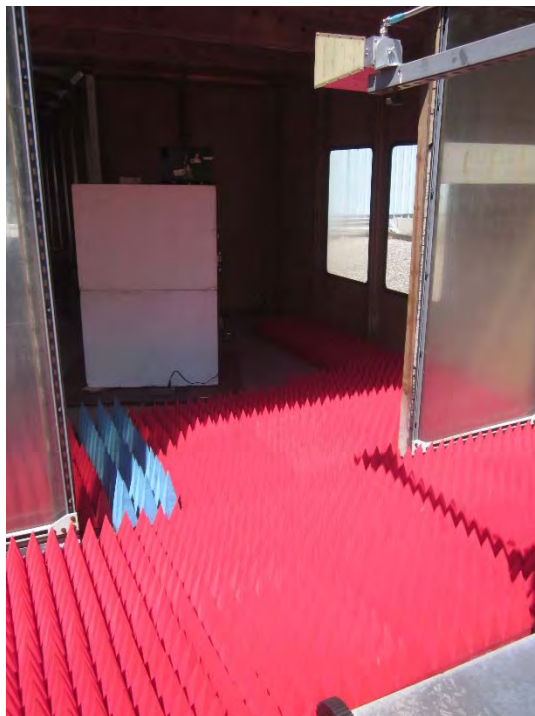
Vertical Antenna Polarization, 1 GHz to 18 GHz