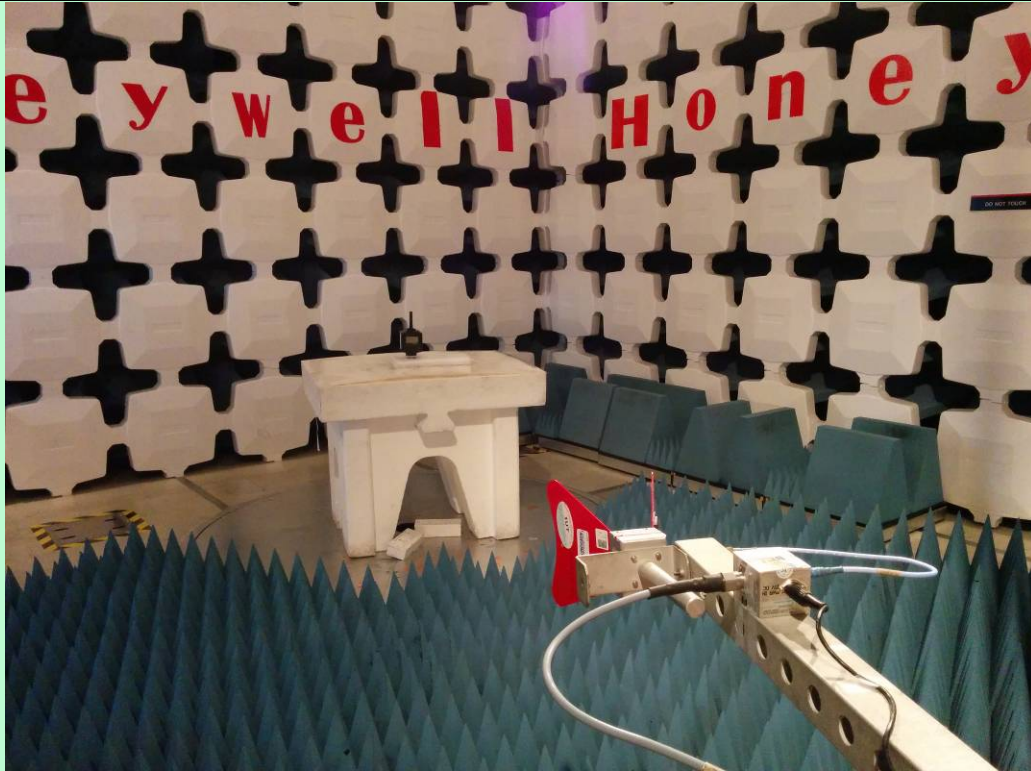
Radiated Emission Setup –1 GHz to 18GHz [Horizontal Polarization ]