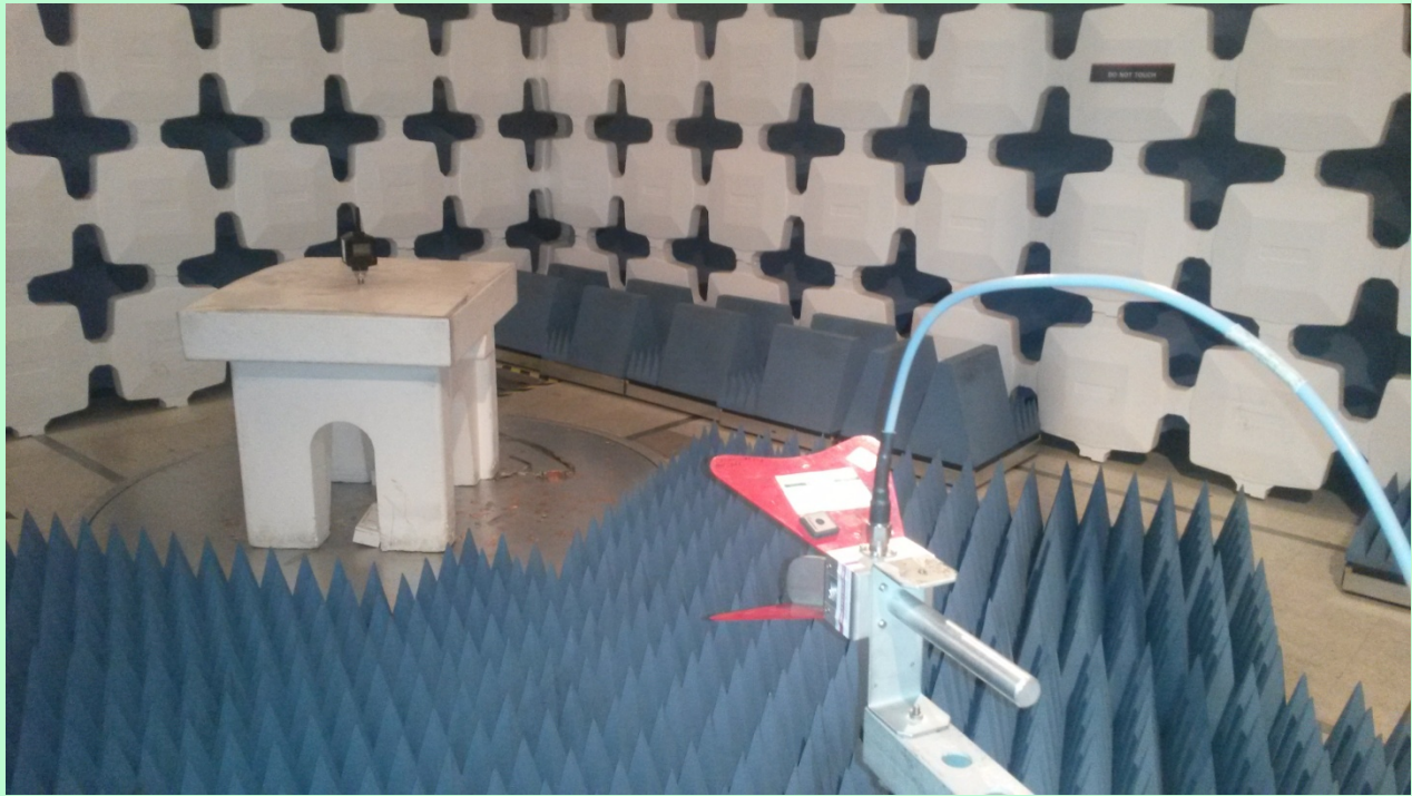
Test Setup : Transmitter Output Power and Dwell Time