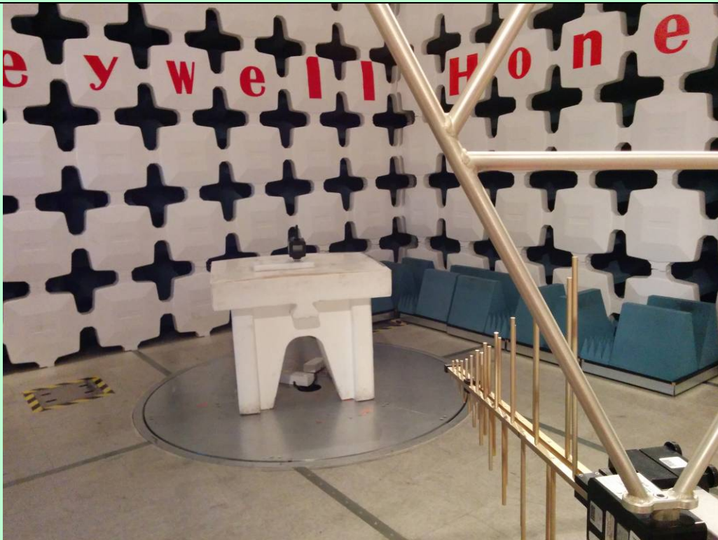
Radiated Emission Setup –30 MHz to 1GHz [Vertical Polarization ]