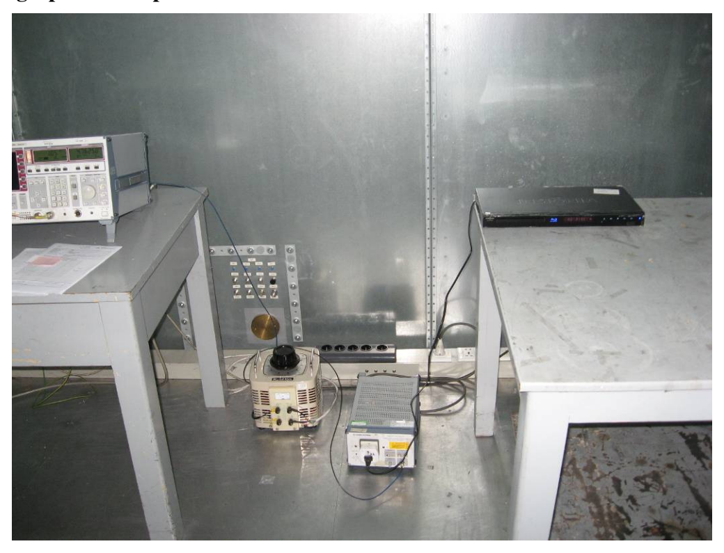
Photograph 1: Set-up for Conducted Emission Measurement