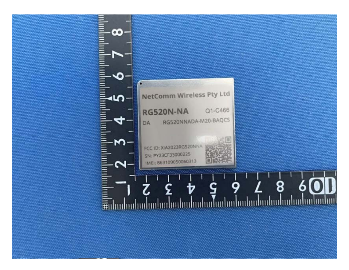
EXHIBIT B - EUT EXTERNAL PHOTOGRAPHS