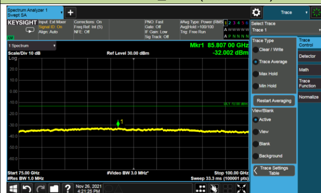
Middle Channel_1RB (Horizontal)