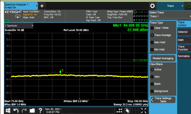
Low Channel_1RB (Horizontal)