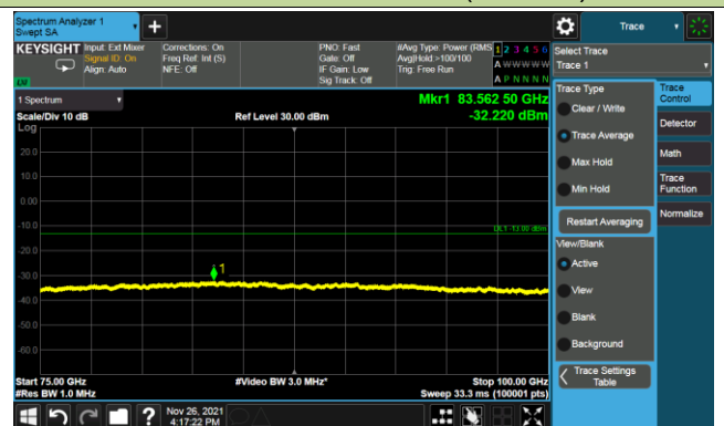
Low Channel_Full RB (Vertical)