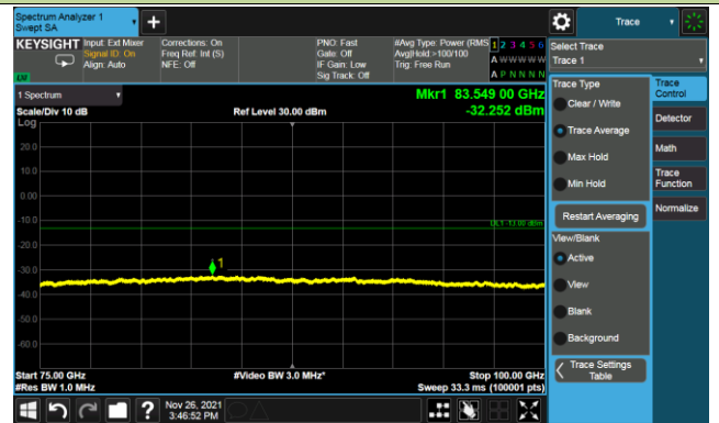
Low Channel_1RB (Vertical)