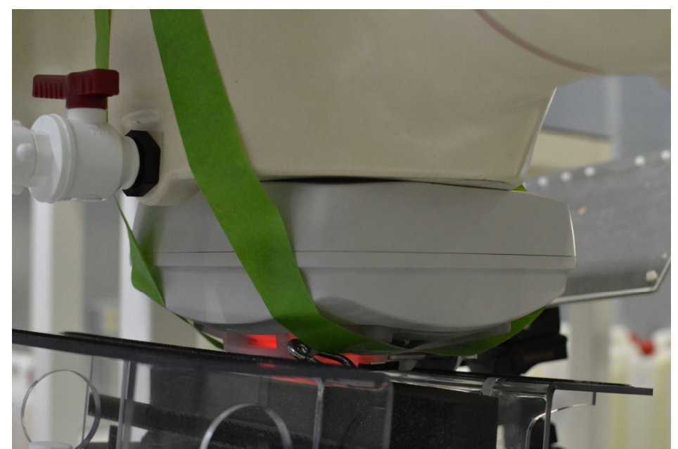
SAR Test Setup Photo 1 - Back Side at 0 mm