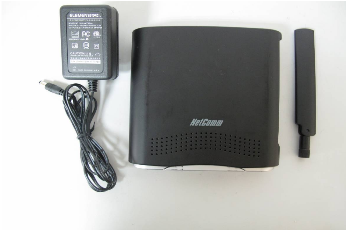
Front View of EUT - 1