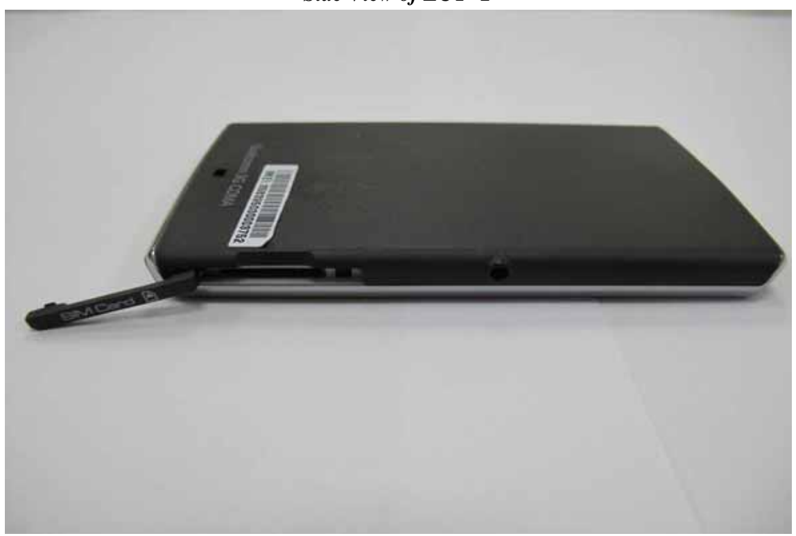
Side View of EUT -3