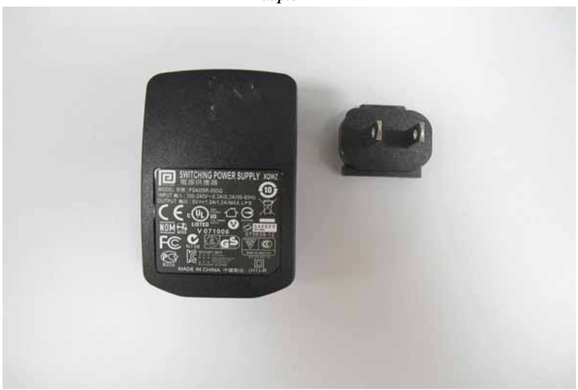
Adapter - 2