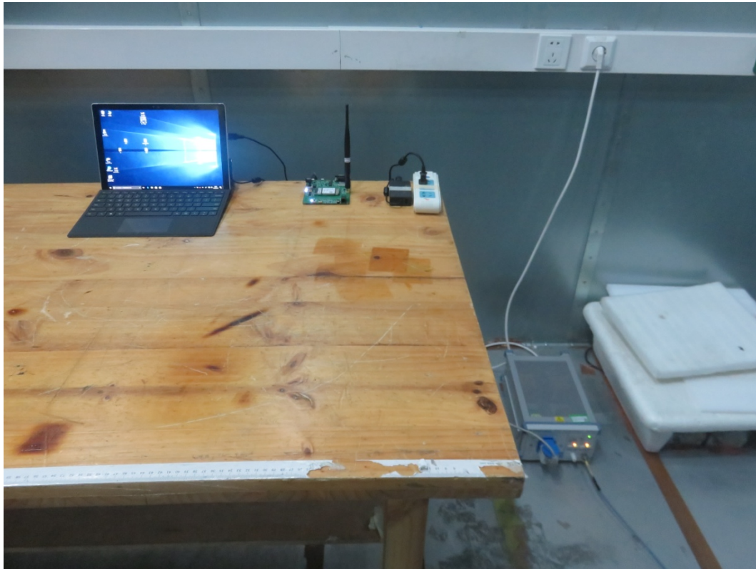
Picture 3 Conducted Emission Test Setup