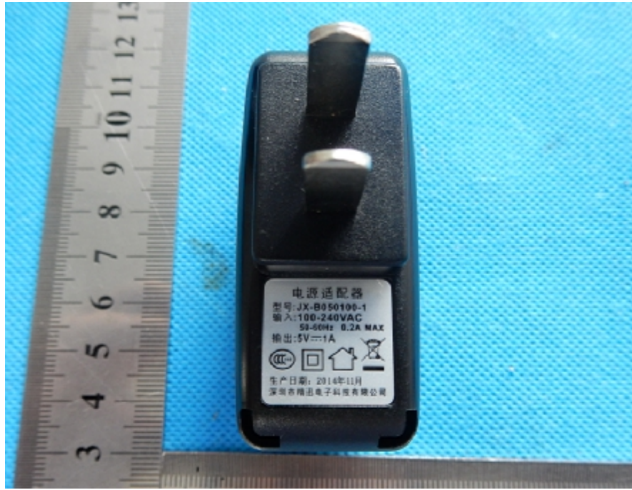
Lab provides adapter