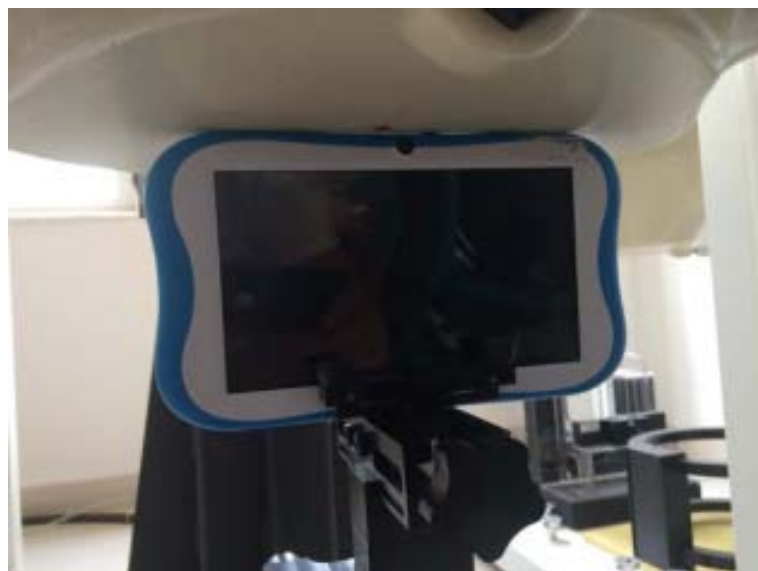
0mm Body Top Side Setup Photo