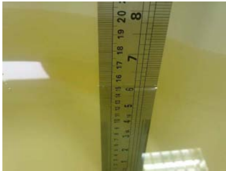
Photograph of the depth in the Body Phantom (2450MHz)