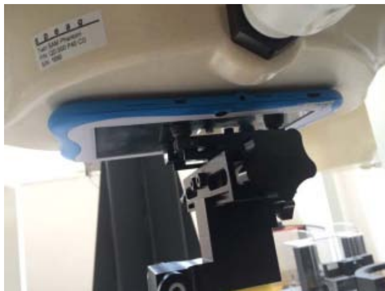
0mm Body Rear Side Setup Photo