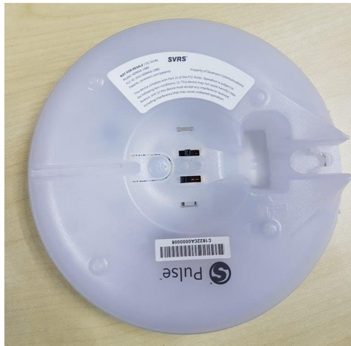
Physical Location of FCC Label on EUT