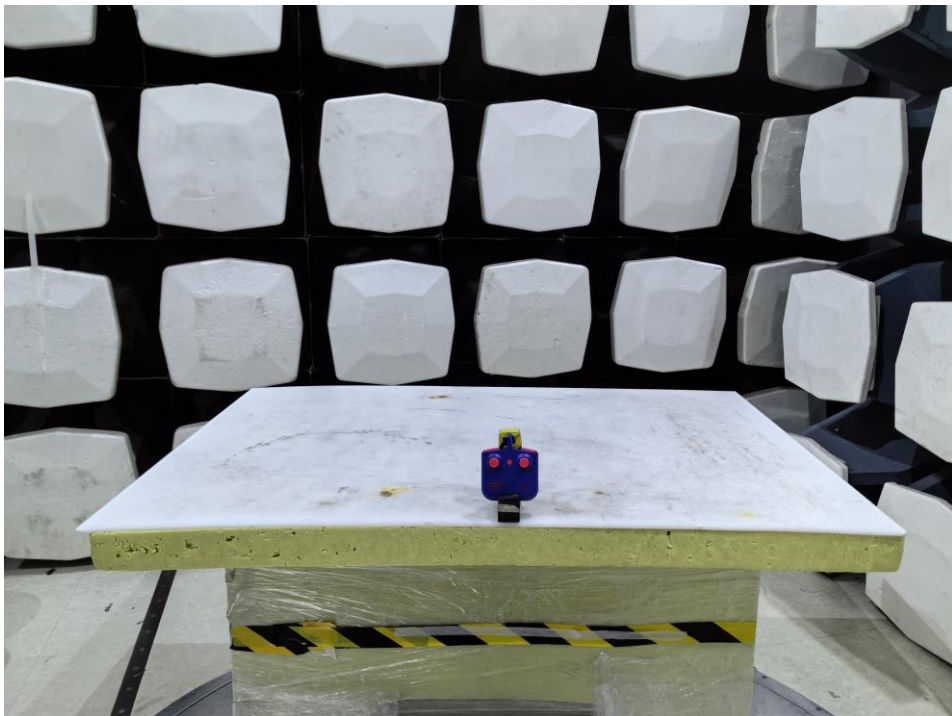
Up to 1GHz (EUT was placed in the centre of the turntable)