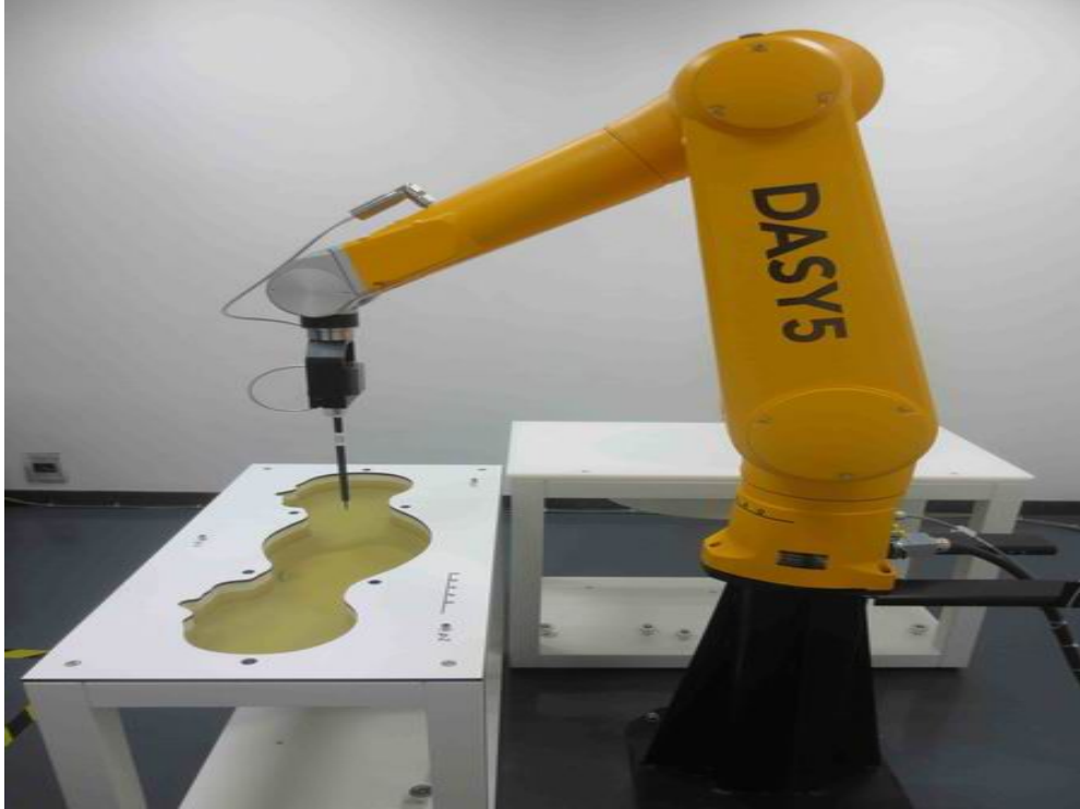
2.4G Liquid depth in the flat Phantom (15cm depth)