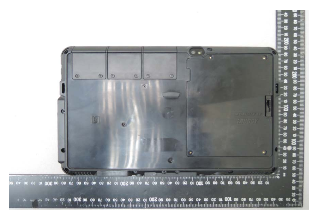
Side View of EUT – 1