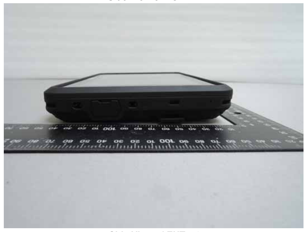
Side View of EUT - 3