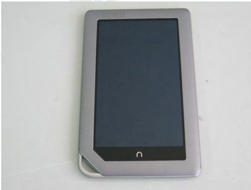
Fig.5 Front view of device