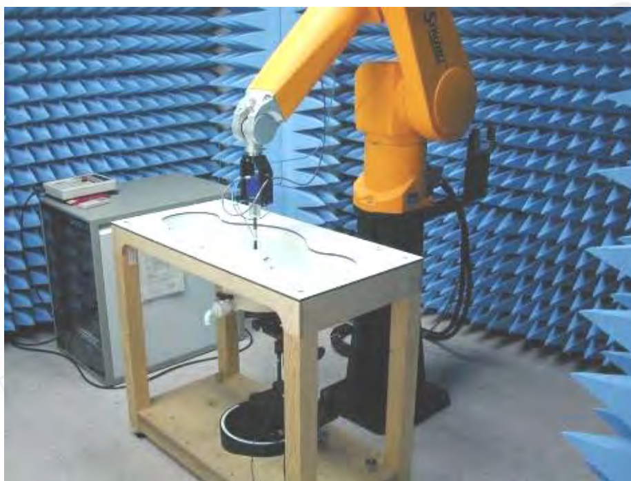
Fig.1 Photograph of the SAR measurement System

Unless otherwise stated the results shown in this test report refer only to the sample(s) tested and such sample(s) are retained for 90 days only. 除非另有說明，此報告結果僅對測試之樣品負責，同時此樣品僅保留90天。本報告未經本公司書面許可，不可部份複製。