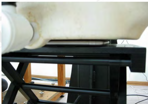
Fig.3 Lap-held mode