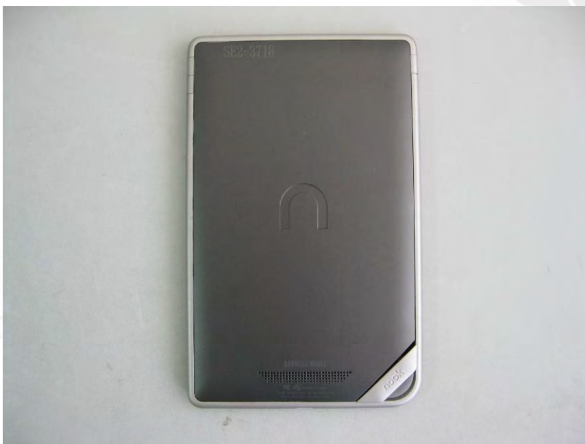
Fig.6 Back view of device

Unless otherwise stated the results shown in this test report refer only to the sample(s) tested and such sample(s) are retained for 90 days only. 除非另有說明，此報告結果僅對測試之樣品負責，同時此樣品僅保留90天。本報告未經本公司書面許可，不可部份複製。