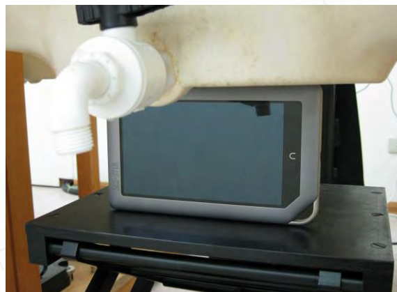
Fig.4 Primary Landscape mode

Unless otherwise stated the results shown in this test report refer only to the sample(s) tested and such sample(s) are retained for 90 days only. 除非另有說明，此報告結果僅對測試之樣品負責，同時此樣品僅保留90天。本報告未經本公司書面許可，不可部份複製。