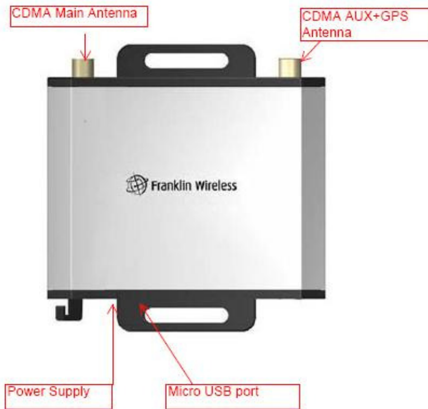
Figure-1 Structure of the S600C