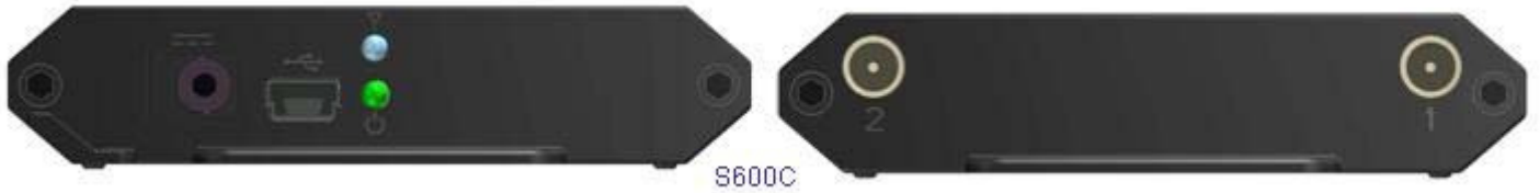
Figure -4 Port definition of RF connectors