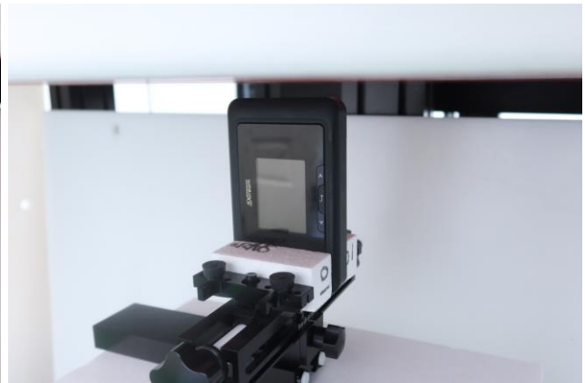
Right Side at 10 mm