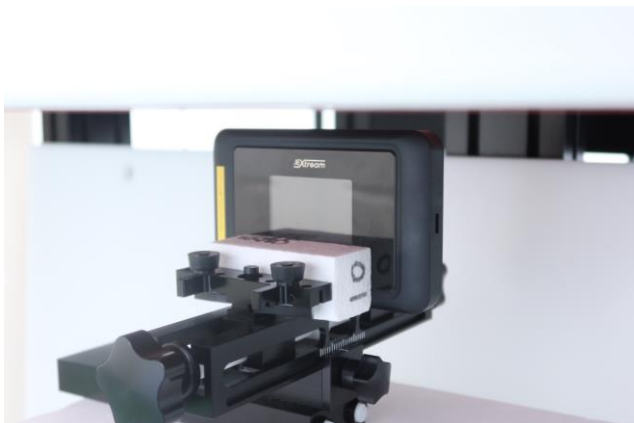
Top Side at 10 mm