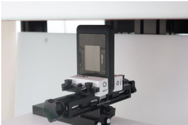
Left Side at 10 mm