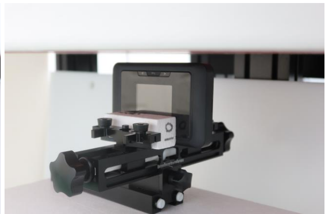
Bottom Side at 10 mm