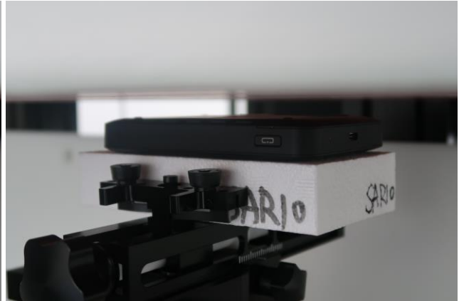
Back at 10 mm