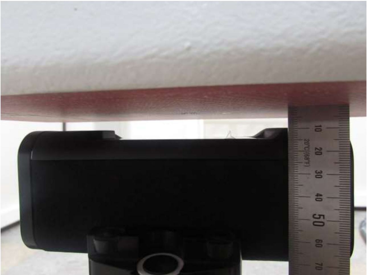
[Distance of 1.0 cm from the EUT]