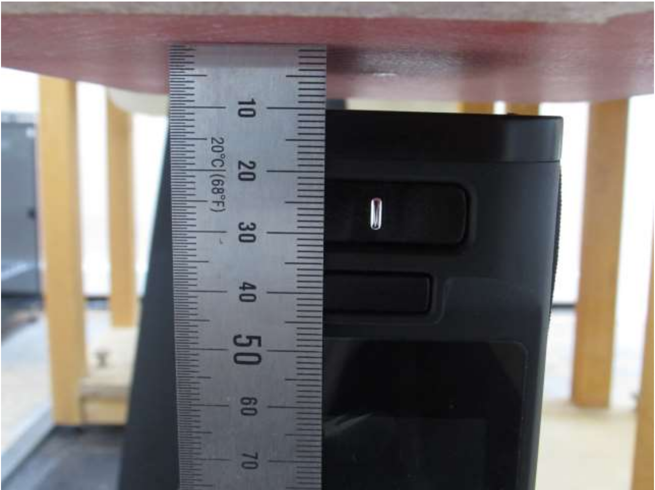
[Distance of 1.0 cm from the EUT]