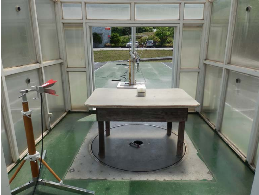
EUT ZX SCAN