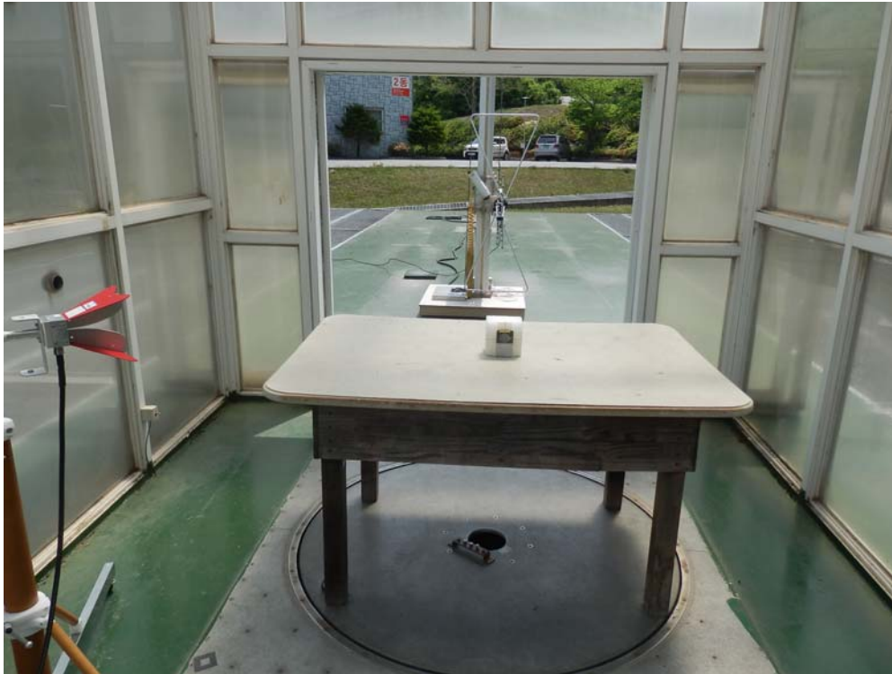
EUT XY SCAN