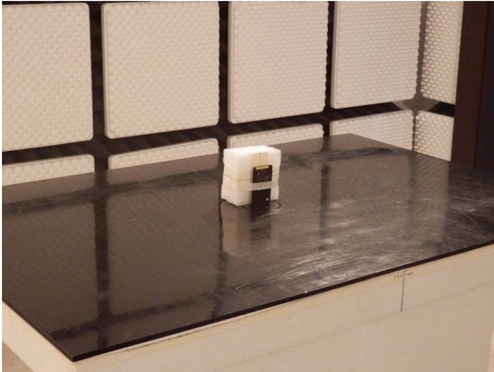
EUT XY SCAN