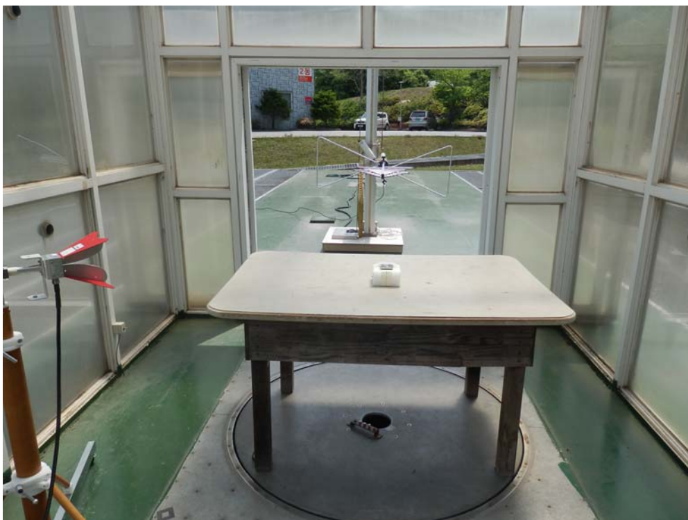
EUT YZ SCAN