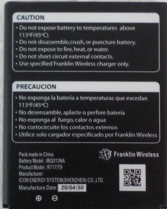
Rear View of Battery