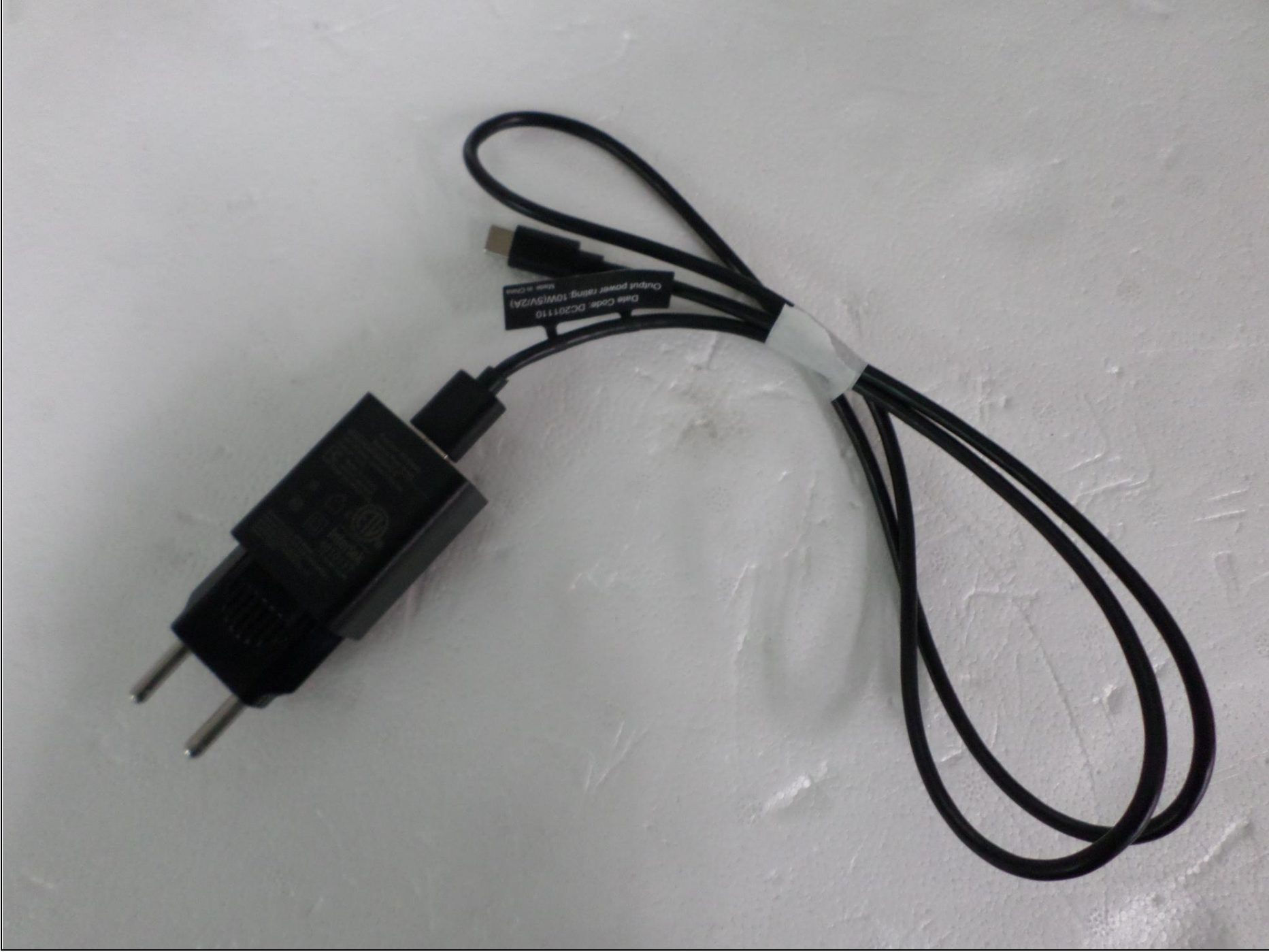
Front View of Travel Adapter