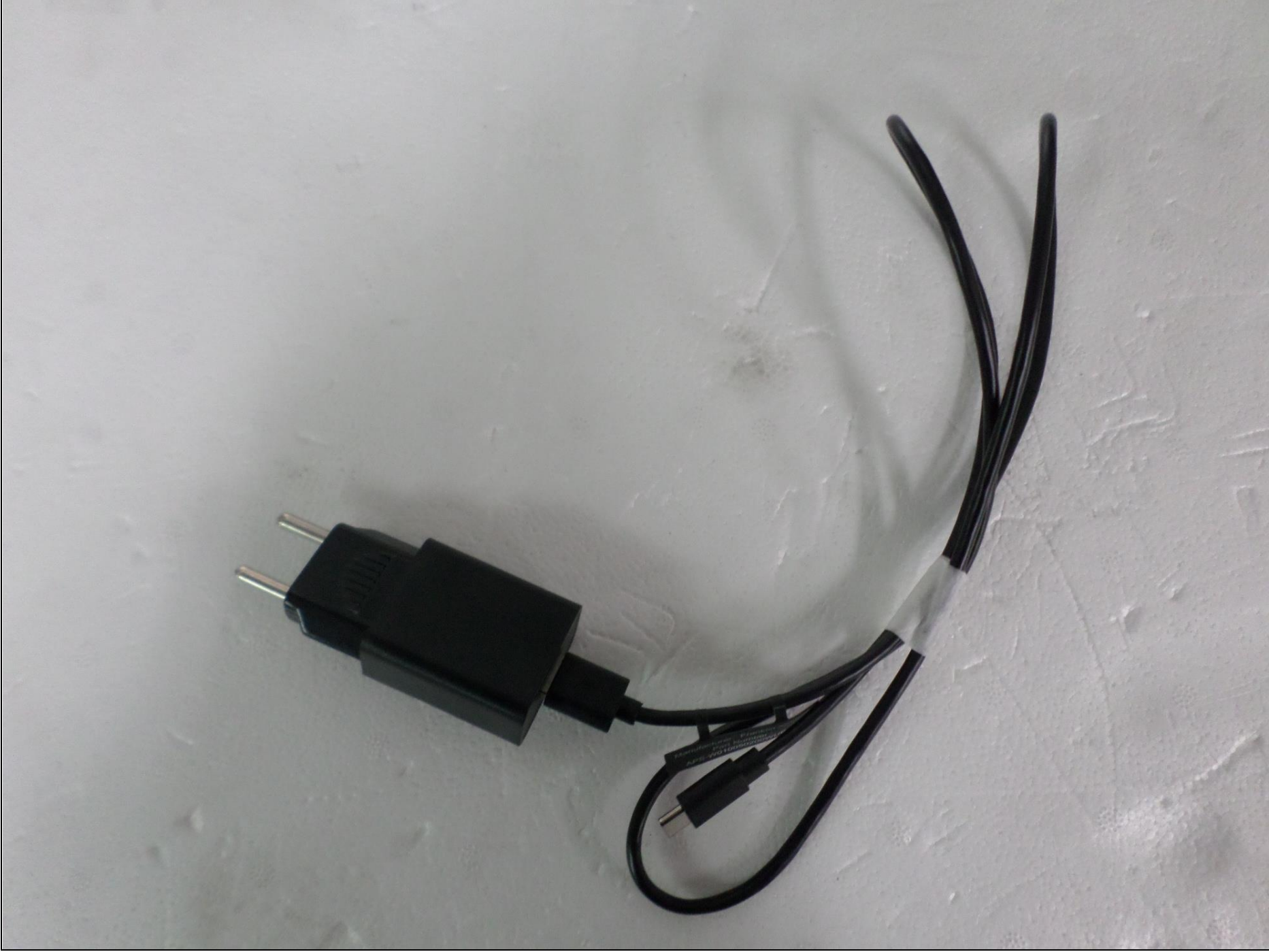
Rear View of Travel Adapter