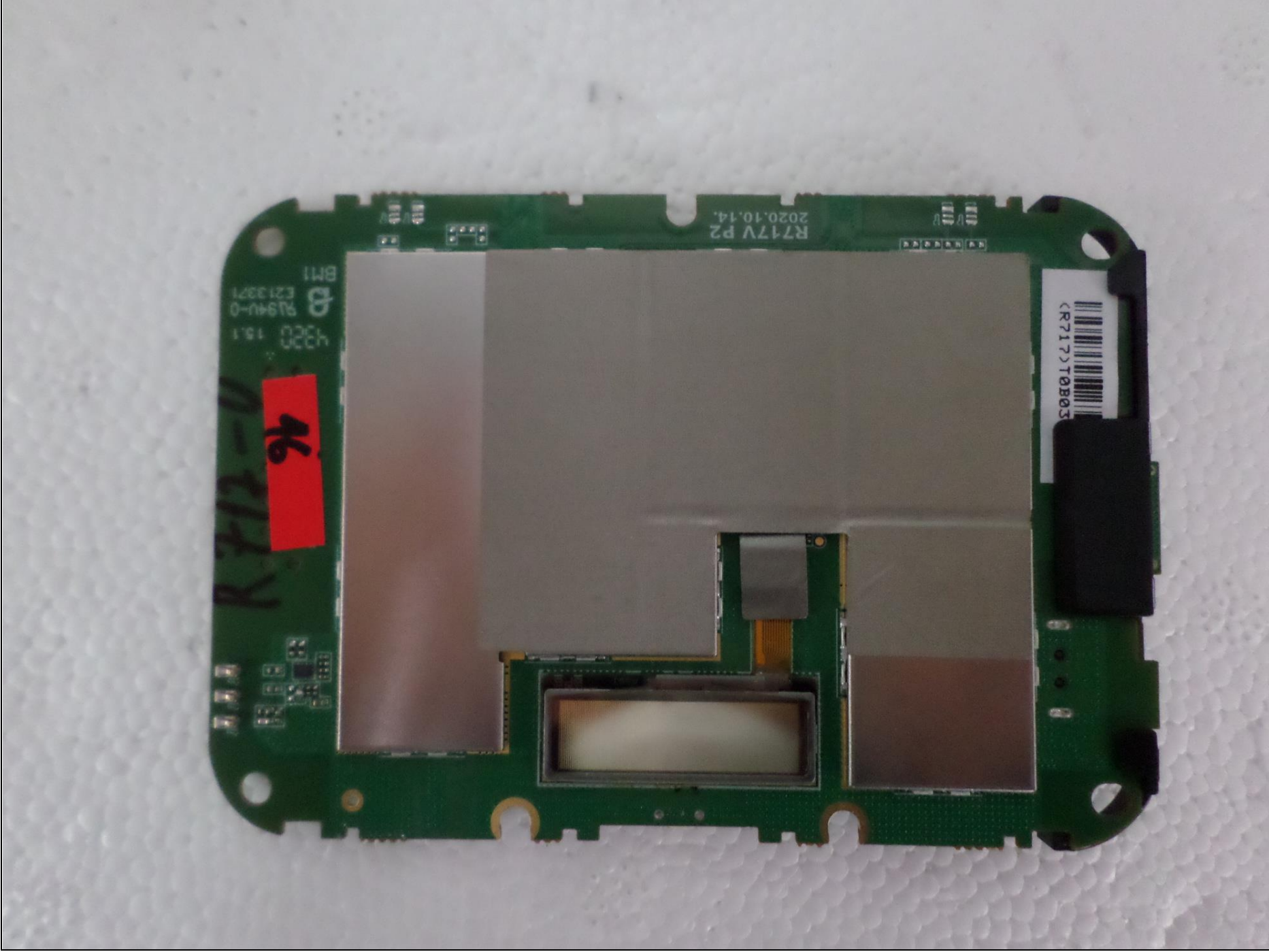
Rear View of Main Board