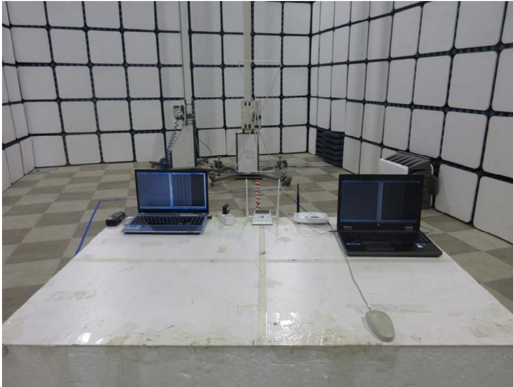
30 MHz to 1 000 MHz _ EUT & Switching adaptor