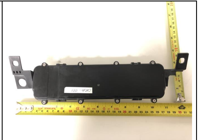
EUT – Bottom View