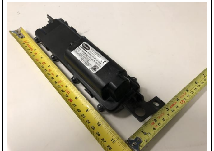
EUT – Side View 2