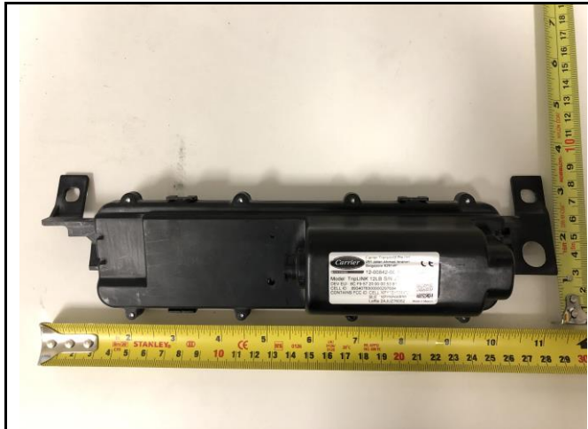
EUT – Top View