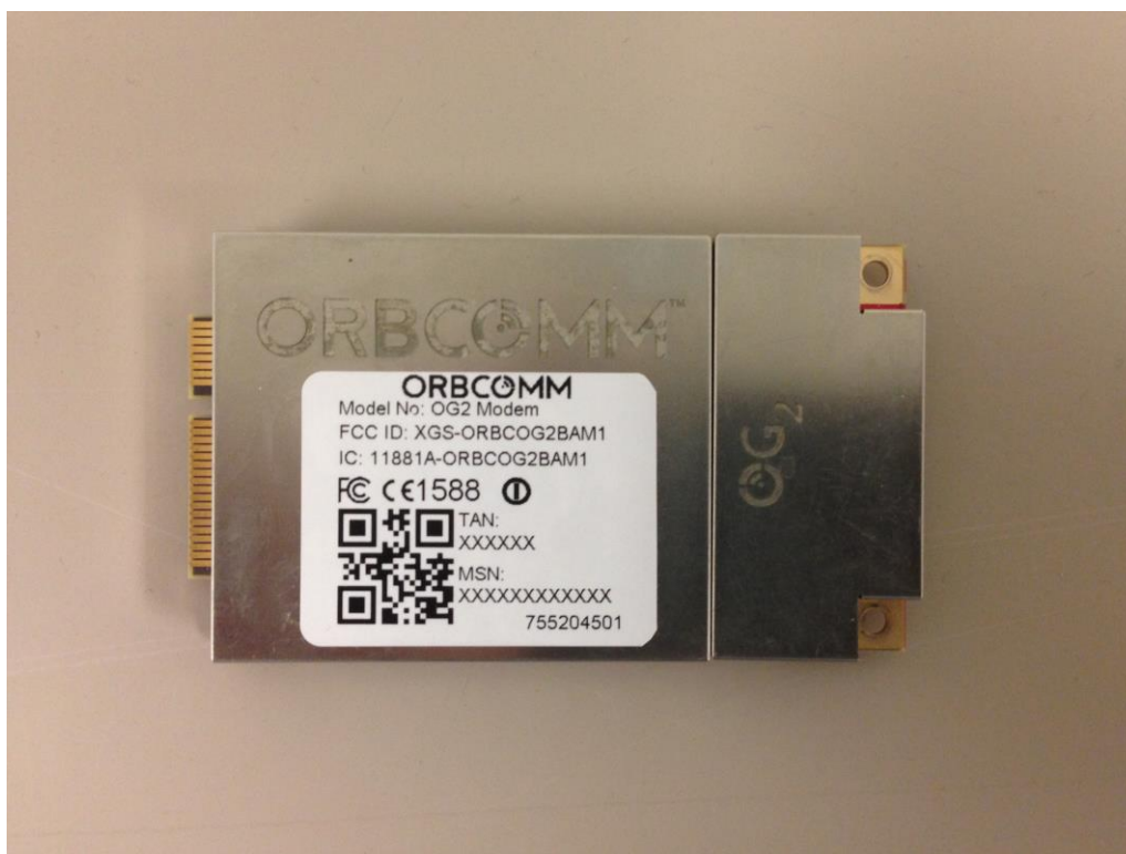
Figure 3.1 OG2 Modem top view with shielding