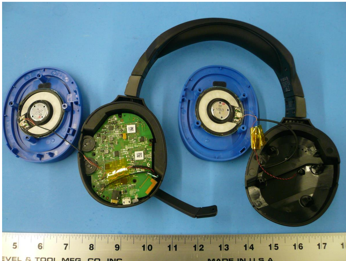
Figure 2: Internal Photo of Ear Force Stealth 700P RX - Remove Speakers