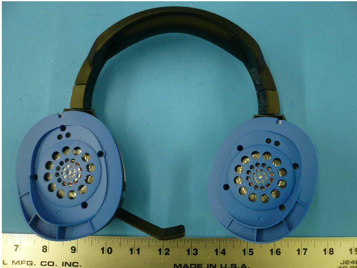
Figure 1: Internal Photo of Ear Force Stealth 700P RX without Ear Cover