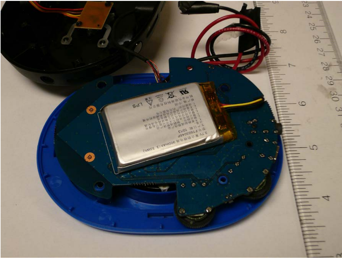
Figure 2: Internal Photo of Ear Force Stealth 500P RX - Bottom